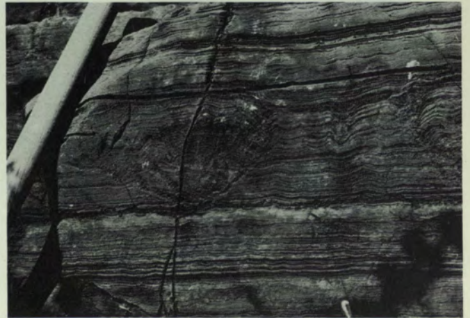
Fig. 8. Fan-shaped domical structure on elongate mounds. (Scale : 3,5 cm in width)