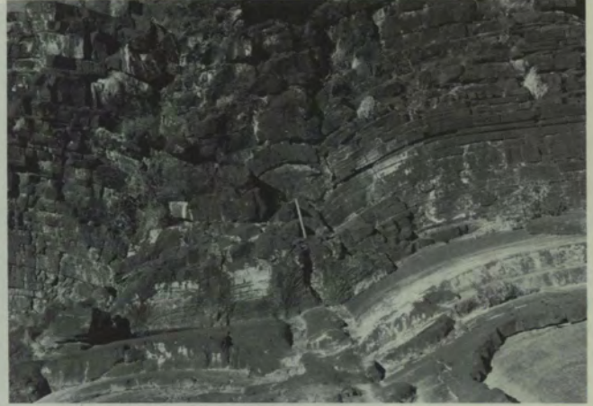
Fig. 4. High inheritance and relief of elongate mounds. (Scale : 60 cm in length)