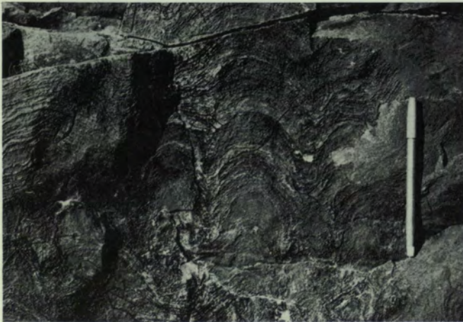
Fig. 7. Linked columnar minor structure on elongate mounds. (Scale : 15 cm in length)