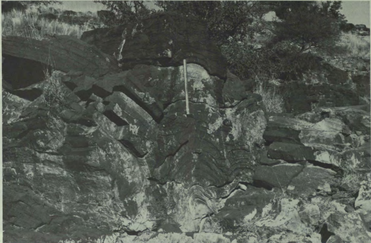
Fig. 5. Axial zone domical structure. (Scale : 60 cm in length)