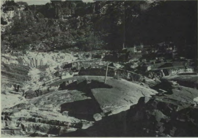
Fig. 3. Contiguous tops to large elongate mounds, elongated east-west. (Scale : 60 cm in length)