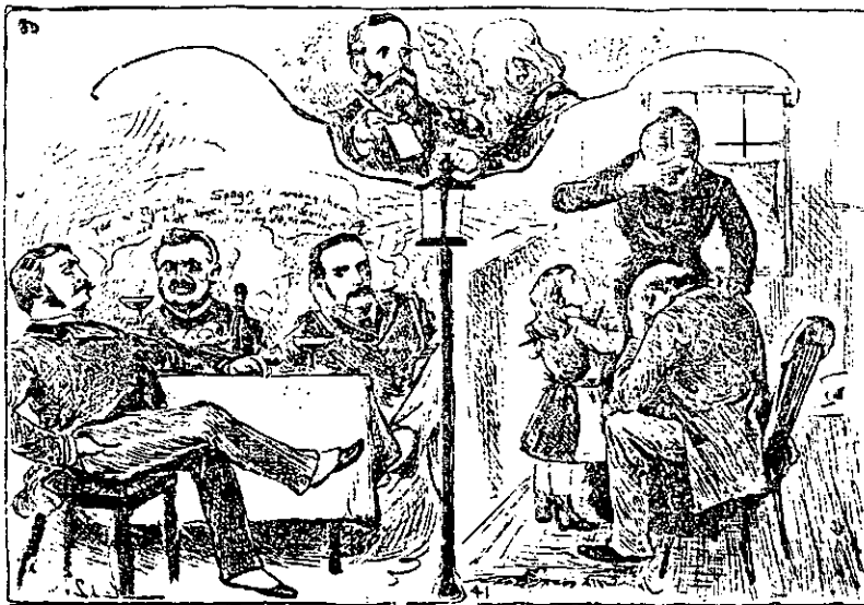
RETRENCHING THE CAPE CIVIL SERVICE.