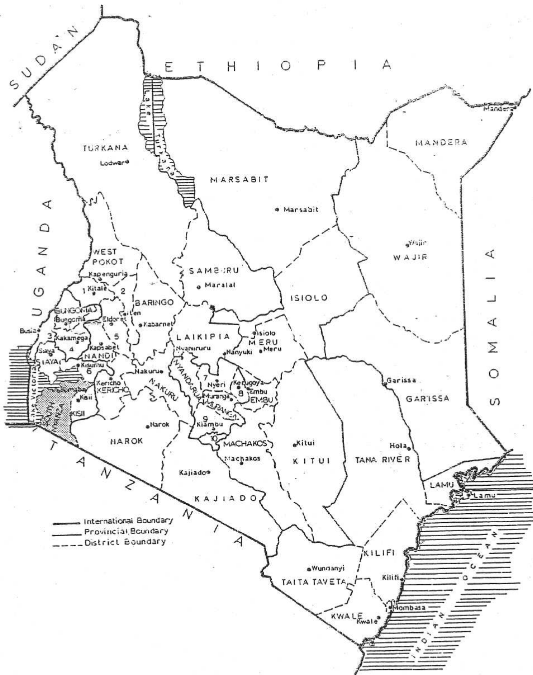
A MAP OF KENYA, SHOWING STUDY AREA, SOUTH NYANZA.