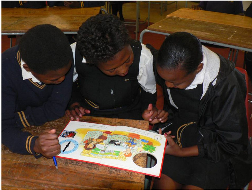
Plate 7: Keen readers share a picture book