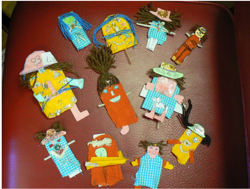
Plate 3: Finger puppets