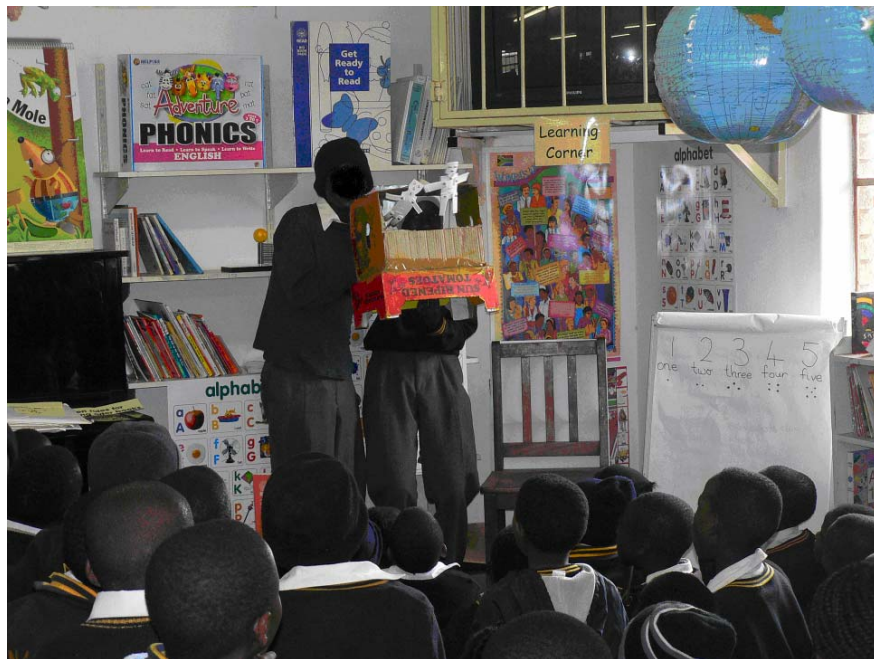
Plate 8: Gr. 6 puppet show