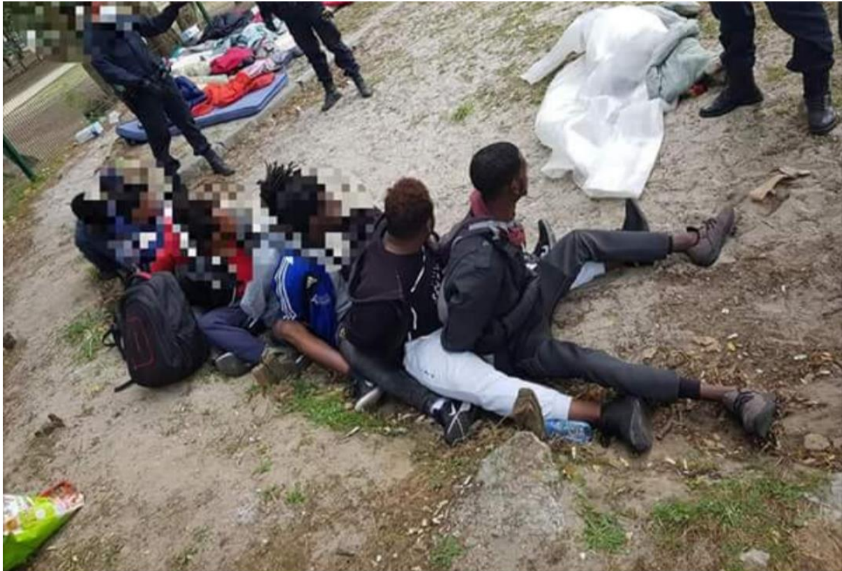
Figure A | Dehumanisation in Maximilian Park, Brussels (Anonymous)

Something I remember was that the police was on rotation, at least the CRS, there were different groups from different department, and they would treat people in different ways. Someone said to me, 'These are from Marseilles and they are not as bad as the Calais ones.' It seems that they took a different approach; some would even say hello, while others would be much more hostile in their appearance and basic interactions. (Interviewee nr. 39)