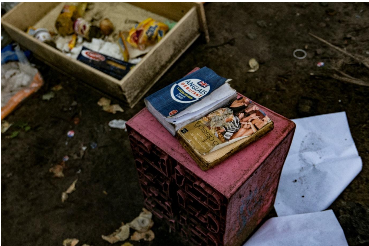
Figure G | Books (Abdul Saboor)

With the destruction of the Calais 'Jungle' camp, fewer spaces for creative projects and daily routines are possible, but not entirely absent. Individuals in the area would find their own ways of accessing books and continue to learn English or French via their phones or books, even in the absence of a home. (See figure G)