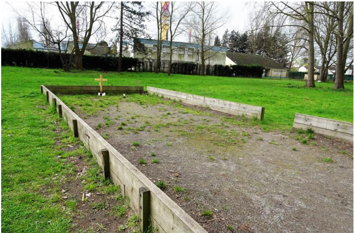
Figure H | Place of worship in Calais, October 2018

An art therapist similarly noted about the aftermath of the camp: 'We've found that people's spirituality and faith is huge, faith in humanity.' The same interlocutor spoke of how individuals would hold on tight to pieces of cardboard and fold them up and hide them during evictions; these were improvised prayer mats. (Interviewee nr. 62a) A Sudanese minor, whom I interviewed in London, explained to me that his time in the borderzone (in the aftermath of the camp) was characterised by strong religious faith: