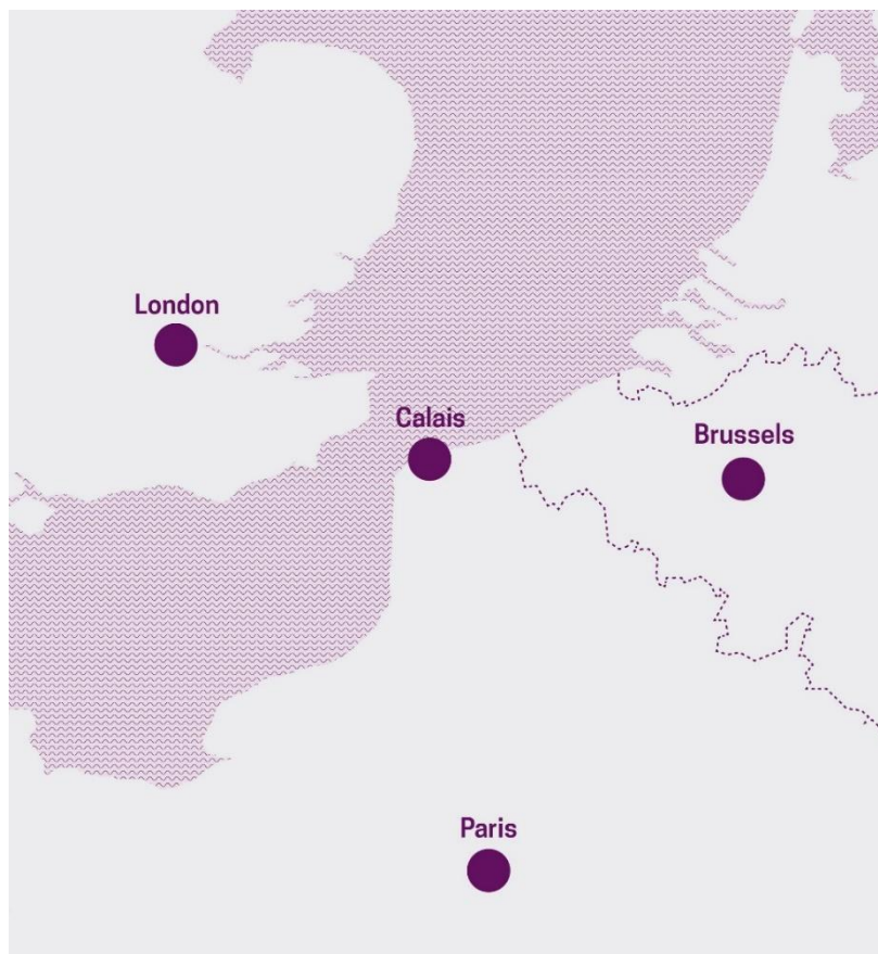
Map 1 | Research Locations across the UK Borderzone

In the previous chapter, relevant strands of debates within critical border and migration studies were explored, thus setting the scene for the research inquiry of the thesis. In this chapter, I discuss the epistemological and ontological positioning of my thesis, before addressing my methodological choices, as well as my reflections relating to ethnography-inspired and multimethod field work across multiple locations in the UK-France borderzone, more specifically in Calais, Paris and Brussels; all of which are major migratory nodal points for migrants seeking to eventually cross the UK border (Map 1). I introduce the various field research methods adopted and how the field work has been carried out in practice. Importantly, I also reflect on my criticality and questions of representation, subalternity, and reflexivity in the context of conducting field work and in the phase of analysing research findings, while writing up the project itself.