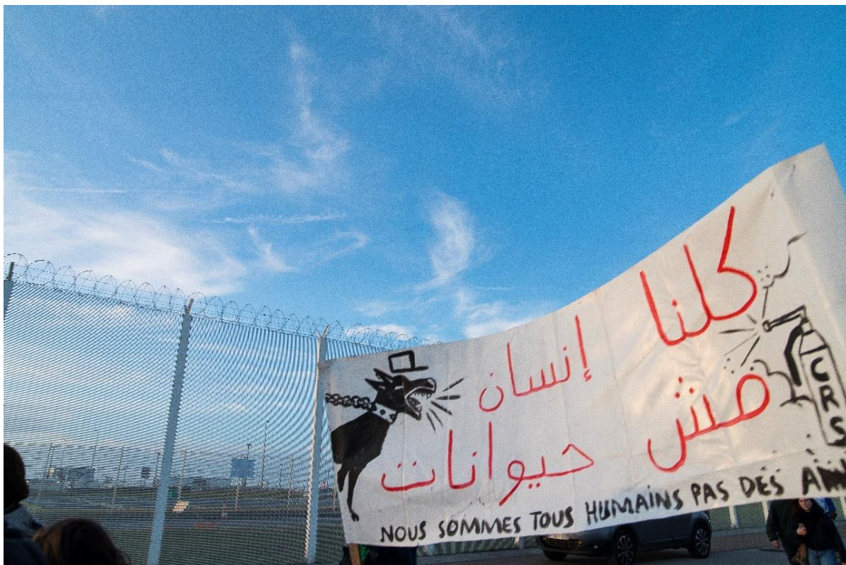
Figure M | Appel d’Air Demonstration

Various forms of activism were highlighted throughout the experiences of my interlocutors and interviewees, as the northern France area has seen action and protest under different guises over the years, including demonstrations, court cases, press conferences, and associative fora (Lequette and Le Vergos, 2016: 212). During the time of the Calais ‘Jungle’ camp, some of its residents came together to meet with visiting British members of parliament to raise their grievances and recommendations. An interviewee explained to me: ‘We met Jeremy Corbyn, Alf Dubs, and many different MPs, and we spoke to them, we said that this is not a good situation.’ They also took action and sent letters to the UK Government regarding the need for constructive solutions. One Sudanese interlocutor explained to me: