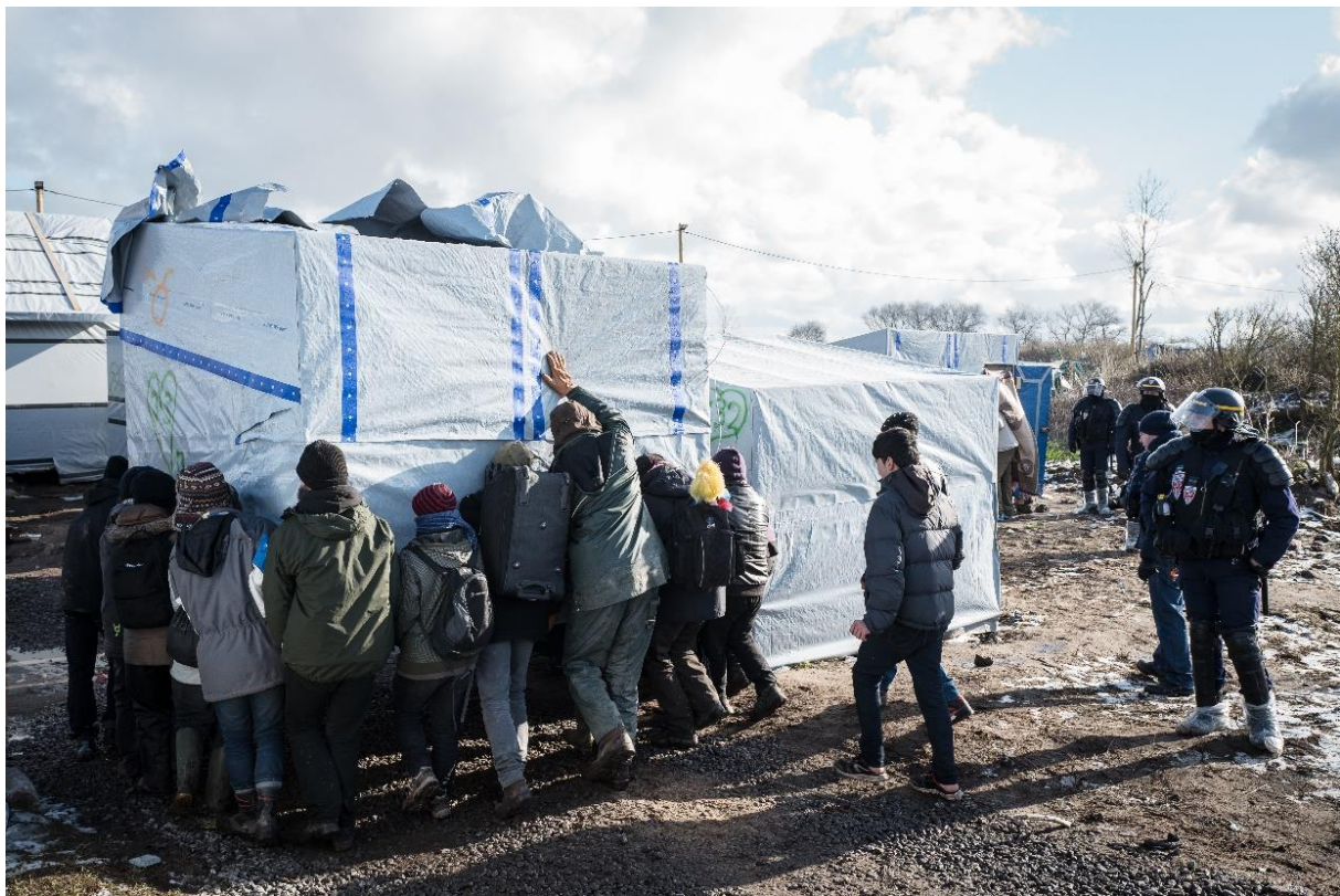
Figure D | Moving shelters prior to demolition

Following the demolition of the camp, settlements and encampments would soon start to crop up across the area, only to be closed down again by the authorities weeks or months later. However, rather than pushing people out of the area, this merely led to individuals going into further hiding and moving to alternative spots. This futile cycle of closing of spaces has continued to be reproduced ever since the demolition of the camp until the time of writing, in November 2020.