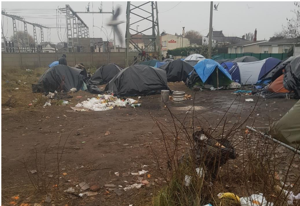
Figure B | Living conditions in Calais, December 2019

Women, children, sick... there are families with children here... That poor woman with a 3 or 4-year-old child, how can they tolerate this? We have people here who have a broken leg, who have a cold, or don't feel well and can't walk... they will freeze from the cold. Illness, sickness... (Interlocutor nr. 45a)