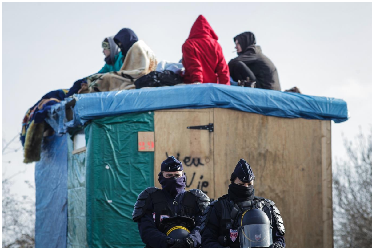
Figure I | Eviction of the Calais 'Jungle' Continues

of tricks for survival, of mutual care, of social relations, of services exchange, of solidarity and sociability that can be shared, used and where people contribute to sustain and expand it' (2013: 190). As Nyers (2015: 32) comments, this might constitute a different world from that of citizens, but importantly, it is not separated from it. Here, we would ask how migrant subjects constitute themselves as citizens, irrespective of their legal status. At the same time, however, I have shed light on a state of ambivalence and an interplay of control and agency, as many of the actions taken in the borderzone are both produced and productive of both agency and control. The destruction of the Calais 'Jungle' camp (see Figure I) was a stark reminder of this entanglement of agency and control, and the processual fragility of acts of defiance and resistance within asymmetrical power relationships.