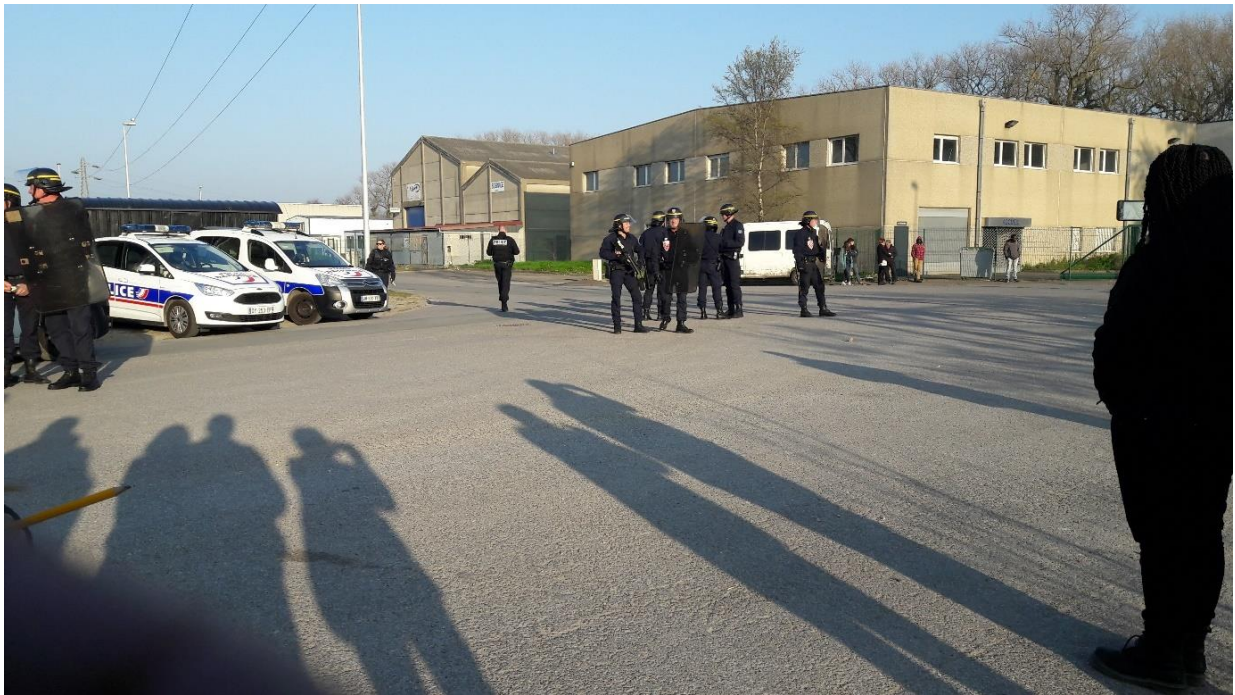
Figure C | Stand-off in Calais, October 2017