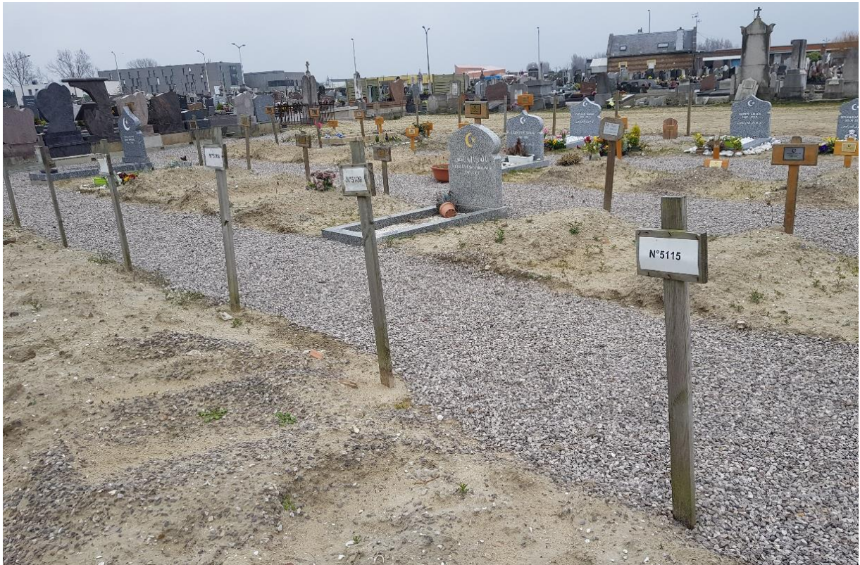
Figure J | Calais North Cemetery

In memory of the tragic death of a boy named Kiyar, highlighted in the previous chapter, a group of migrants, also joined by activists, organised a public manifestation during which they mourned those who have been killed at the border, combined with a political call to action to stop future deaths. See figures K and L. Overall, the different forms of collective and individual acts of grieving and mourning the dead in the UK-France borderzone can be understood as important migrant subjectivities, which serve to re-appropriate the humanity and grievability of migrant lives. In Frames of War , Butler (2009: 38) writes: