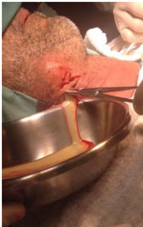
Figure 3. Intraoperative view of the purulent content of the lesion.

Santos Gorjón et al 9 performed a large descriptive review of cases of deep neck infections, reporting that most of the patients exhibited involvement of peritonsillar and submandibular areas. In detail, the authors also revealed that submandibular abscesses