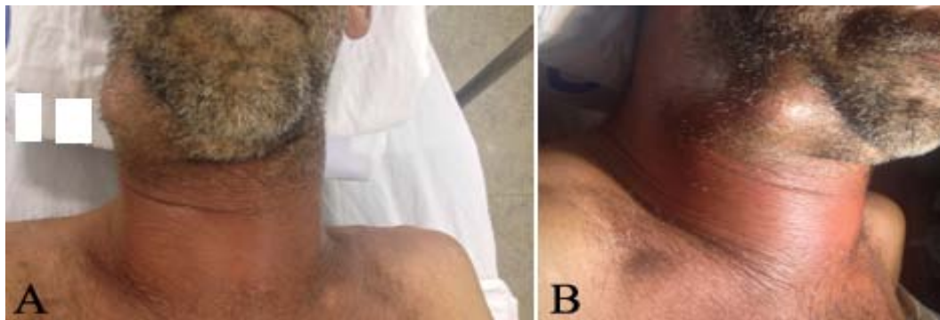
Figure 1. Preoperative clinical presentation of the edema in the right submandibular region in frontal (A) and lateral views (B).

The therapeutic intervention consisted of surgical drainage through an extraoral incision in the submandibular floating area (Figure 3). The procedure was performed under general anesthesia and endotracheal intubation. The incision was followed by digital dissection in the anteroposterior and craniocaudal directions. Two #2 Penrose's drains and one #1 Penrose's drain were installed on the right submandibular region, while a single #1 Penrose's drain was installed in the left submandibular region. A total volume of approximately 200 mL of purulent content was drained from the submandibular region. The patient was medicated with intravenous clindamycin (600 mg, every 6 hours, for 6 days). During this period new blood tests were performed (Table 1). Moreover, the patient presented better conditions, allowing the removal of drains. Follow-up was performed 10 days after the surgical intervention, revealing no sequelae or signs of infection (Figure 4).