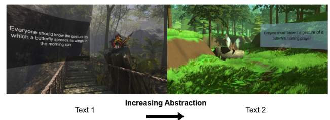
Figure 2: Accompanying text can help modulate the level of abstraction of the interaction