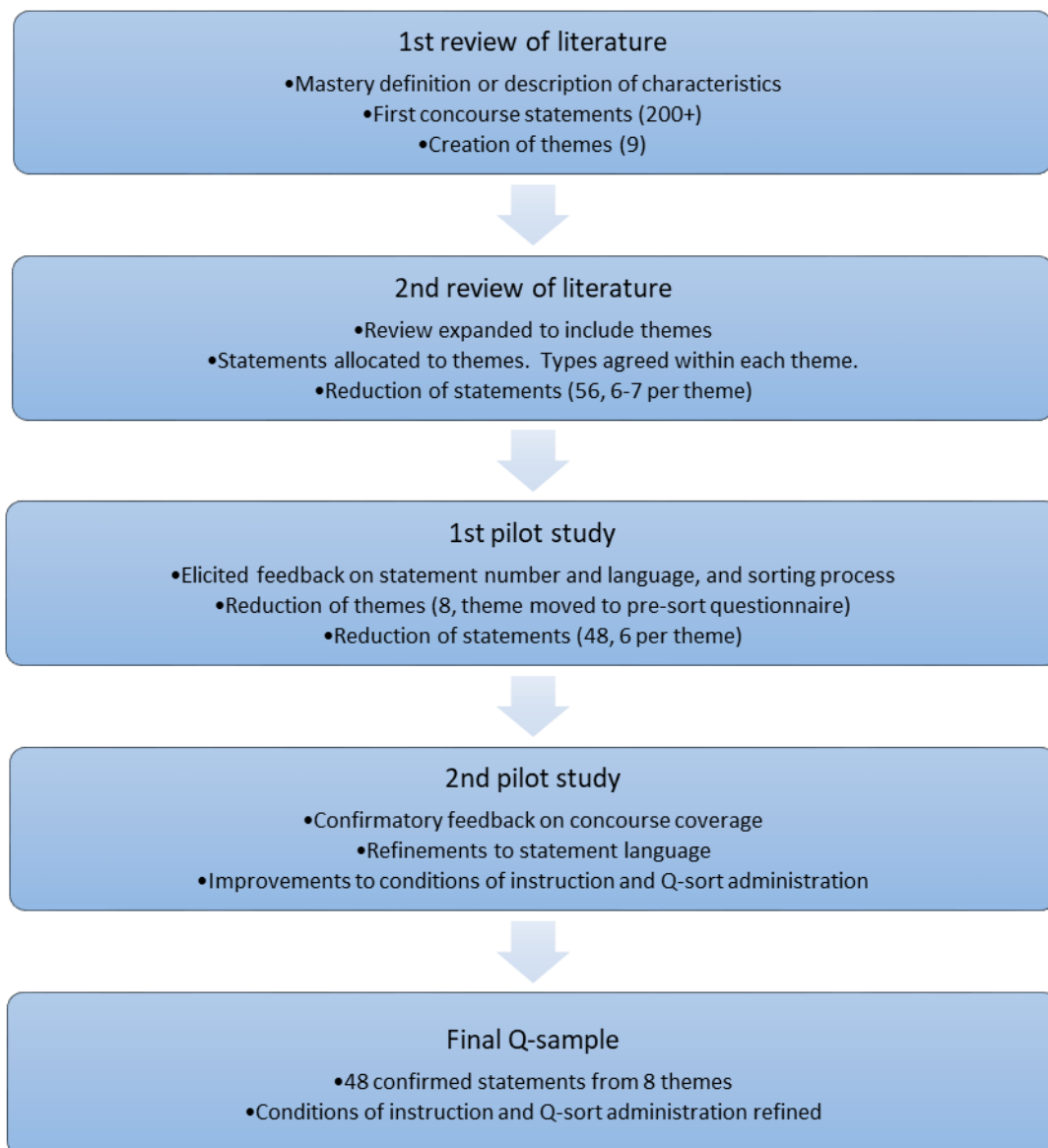
Figure 2: Q sample creation and reduction process

The construction of the concourse and Q sample for this study is shown diagrammatically in Figure 2.