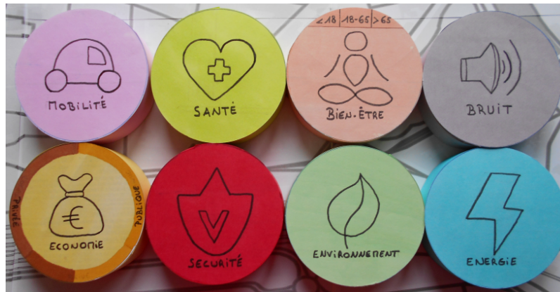
Fig. 2. Prototype of the domain view markers (English translation from left to right: mobility, health, well-being, noise, economy, safety, environment, energy)