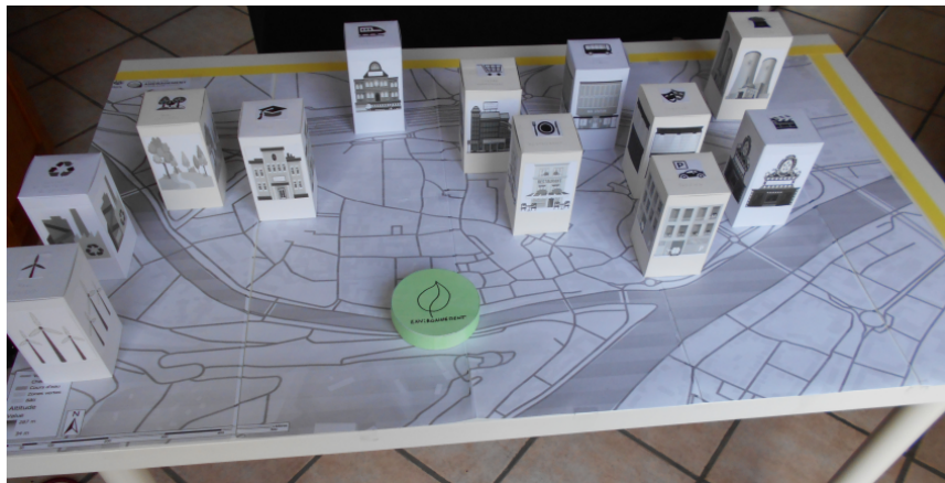
Fig. 4. Example of city model that could be built during the activity. The environment domain view is placed on the city map.