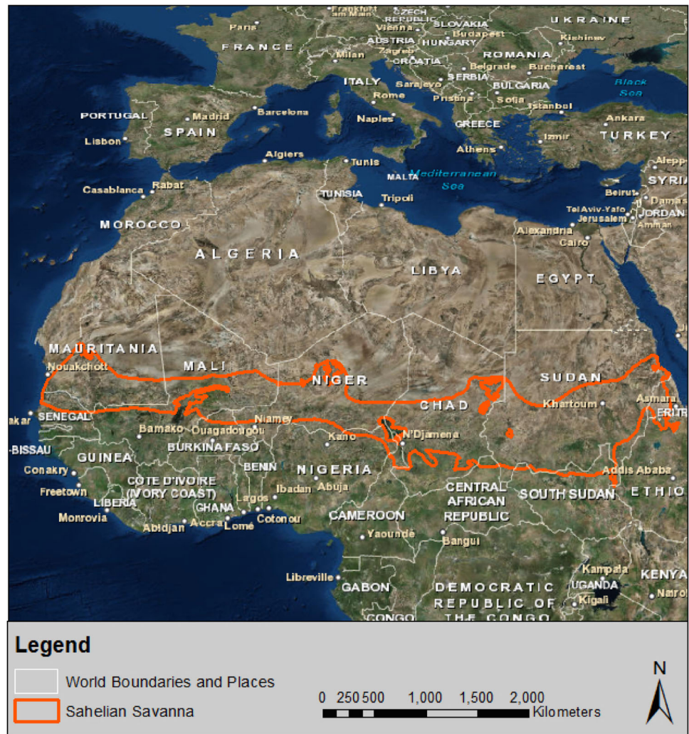
Fig. 2 Sahel eco-region boundaries across Africa Data sources The Nature Conservancy, 2011. tnc_terr_ecoregions (vector digital data). Source data available at http://maps.tnc.org/gis_data.html ; Metadata available at http://maps.tnc.org/files/metadata/TerrEcos.xml

rainfall to decline has already contributed to food insecurity in eastern and southern Africa. Additionally, the expanded ranges of crop pests and altered transmission dynamics of insect pests and plant diseases predicted by climate change will likely exacerbate food availability problems in the Sahel countries (Rosenzweig et al. 2001). Not only can climate change be a significant factor that could undermine food security in Africa, but also ecosystem degradation, population growth, poor governance systems, low adaptive capacity, and economic decline has and will also likely contribute to continuing food insecurity in the Sahel region (Challinor et al. 2007; Funk et al. 2008; Bohle et al. 1994; Brown et al. 2007). The high sensitivity of food crop systems in Africa to climate is also exacerbated by constraints such as a heavy disease burden, conflicts and political instability, debt burden, and an unfair international trade system (Challinor et al. 2007). Therefore integration of climatological and hydrometeorological EWS in land-use and food planning processes could