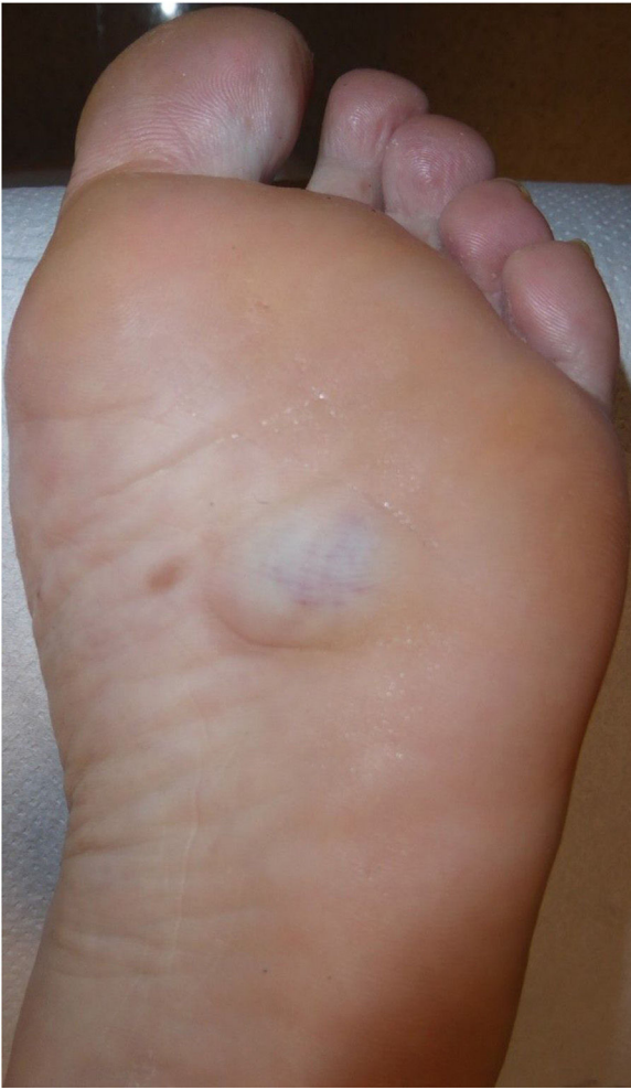
Figure 1 Clinical image showing a bluish nodular lesion of approximately 3 cm in size.

(Fig. 1). Skin ultrasound with a high-frequency (6–19 MHz) linear probe (Esaote MySix®) revealed a poorly defined dermal–hypodermal lesion. Ultrasound in B mode showed tubular hypoechoic foci with mild posterior acoustic reinforcement and isolated hyperechoic structures (Fig. 2A). Color Doppler mode revealed a moderate increase in intralésional uptake that corresponded to high flow and low resistance in spectral mode (Fig. 2B). Histology showed proliferation of dilated vessels with disorganized distribution at the level of the middle and deep dermis, as well as eccrine gland proliferation and foci of adipose tissue (Fig. 3). Due to the size of the lesion and the possible consequences of excisional surgery, it was decided, in agreement with the patient, not to remove the lesion and to adopt a wait-and-see approach.