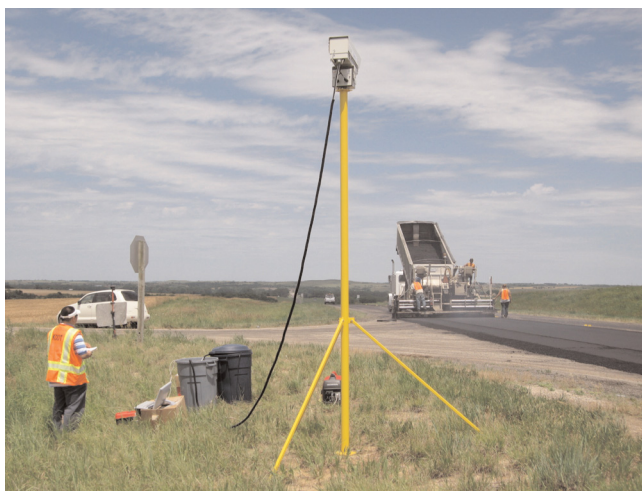
FIGURE 6 Field experiment on measuring productivity of HMA overlay.

Two HIR asphalt rehabilitation projects were carried out on K-192 near Winchester, Kansas, and K-16 near Tonganoxie, Kansas (Figure 7). The total length of highway was 23.8 mi. The contractor, Dustrol, Inc., was awarded these projects at the cost of $1,768,101 and completed them in 12 working days, from July 5 to July 20,