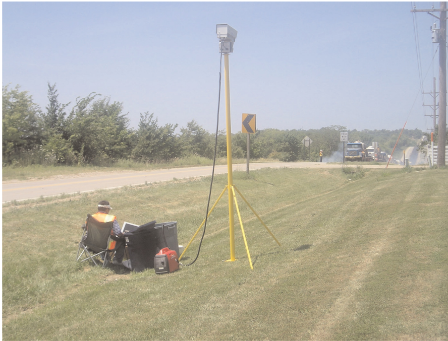
FIGURE 7 Field experiment on measuring productivity of HIR.

data, and the rest of Table 1 shows p -values of normality tests and comparison tests.