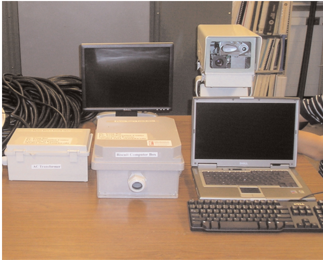
FIGURE 1 Major components of WRITE system.