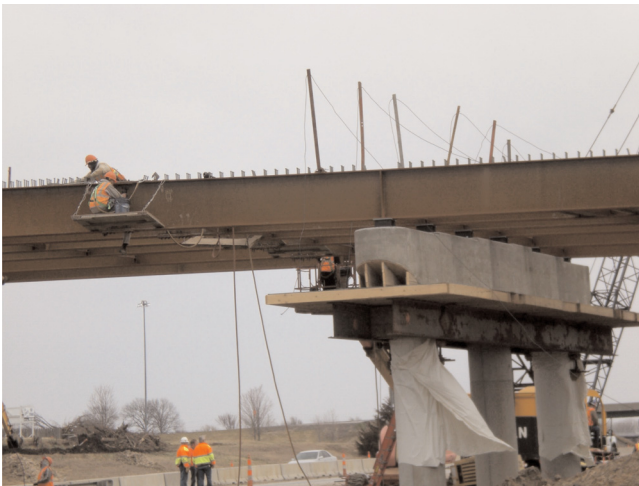
FIGURE 8 Bolting bridge beam operation.

The paired t -test, a parametric test, was conducted to identify whether there were significant differences between the HMA overlay productivity data measured by the stopwatch and by the WRITE