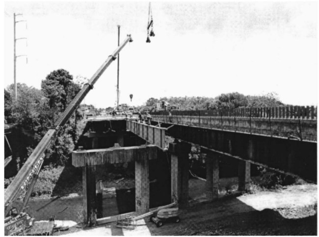
Fig. 2. Placing steel girder on concrete pier cap

Buckley installed the nine steel girder segments on June 8 and 9. Fig. 2 shows a piece of steel girder being placed on a concrete pier cap. Then, construction crews set 4.3-m-wide (14 ft) steel deck pans between the four rows of girders. Next, reinforcing bars were installed in place for the concrete deck. A total of 38 truckloads of concrete were placed to form the new 254 mm (10 in.) deck on Tuesday, June 16. Fig. 3 presents the new concrete bridge deck. While the concrete cured, construction crews poured new parapet walls on the bridge. The compressive strength of the concrete deck exceeded the required 27,560 kilopascals (4,000 psi) less than a week after the deck pour. On June 25,