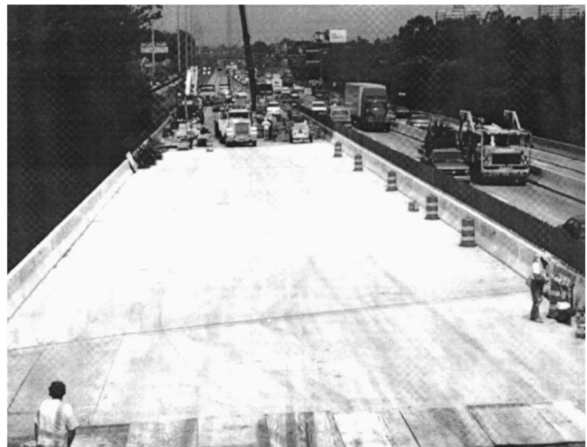
Fig. 3. New concrete deck

PennDOT moved two lanes of traffic back to southbound I-95 before the start of the morning rush (Carey 1998a). Interstate Safety Services of Clarks Summit, Pa., supplied 854 m (2,800 ft) of new concrete barriers to replace the road's central median on June 27, two days ahead of schedule. Installation of the median started the following day. During the reconstruction process, construction was conducted 12 hours per day, 7 days per week. Because of the good weather, hard work, and quick delivery of supplies, the bridge was reopened to the public on June 29. Buckley continued to perform structural work underneath the bridge after the traffic had been restored. All repair work was completed on Friday, July 3, 12 days ahead of the original target date of July 15. Based on past experience, similar repair work could require approximately 6 months under normal conditions. If using conventional bidding procedures, the entire repair process could take even longer. Table 2 presents the major events occurring during the replacement process. Officials from PennDOT stated that the repair project cost less than the original $4,000,000 estimate. Buckley received $500,000 in overtime pay.