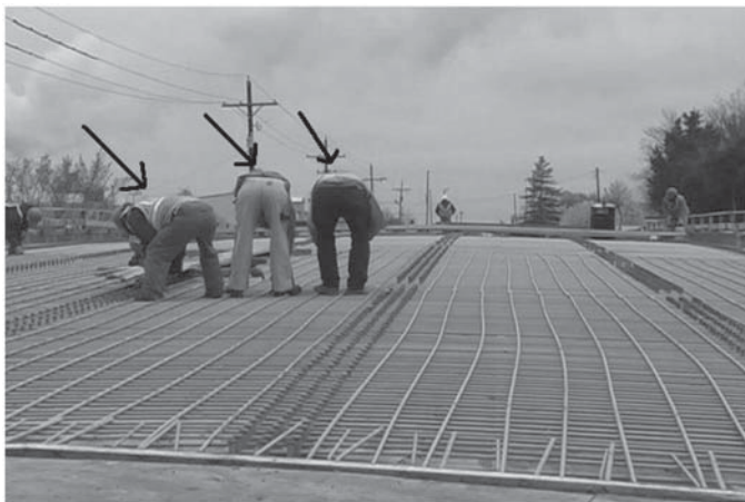
Fig. 2. An image of construction workers tying rebar for the concrete deck