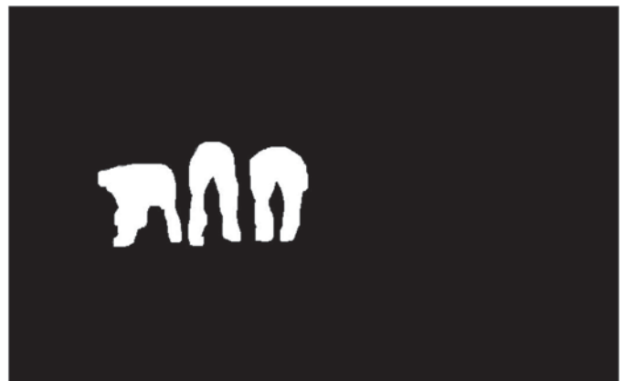
Fig. 3. Silhouettes corresponding to workers in Fig. 2

After filtering the irrelevant objects, an image of a person can be described by using a 256 \times 256 matrix. Each entry of this matrix could be any number from 0–255. The next step was to characterize the workers and to assign them a specific identity. The outline of each worker was identified, and a silhouette was created by clustering pixels in the outline with the region growing technique, in which similar pixels are grouped together to form a single region and are then given a distinct color (Adams and Bischof 1994). Certain attributes for each silhouette (such as centroid location, area, and the minimum and maximum along both the axes) were computed and stored dynamically in a database. Fig. 3 presents silhouettes corresponding to three workers shown in Fig. 2 (where they are identified by an arrow).