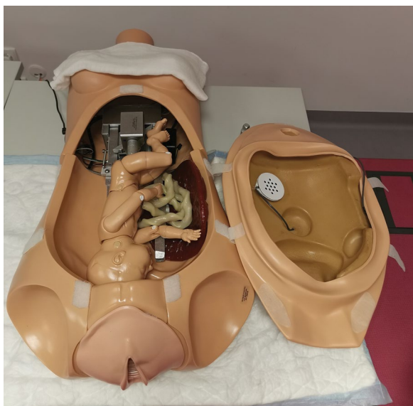
Figure 2. Simple mechanical childbirth trainer

simulation performed with low and high fidelity. Healthcare workers were supposed to deal with shoulder distortion during labour simulation. Both methods improved the results of shoulder dystocia treatment. The use of an advanced simulator gave additional benefits resulting from the possibility of assessing the force used to perform the manoeuvre, as well as communication with the patient [12].