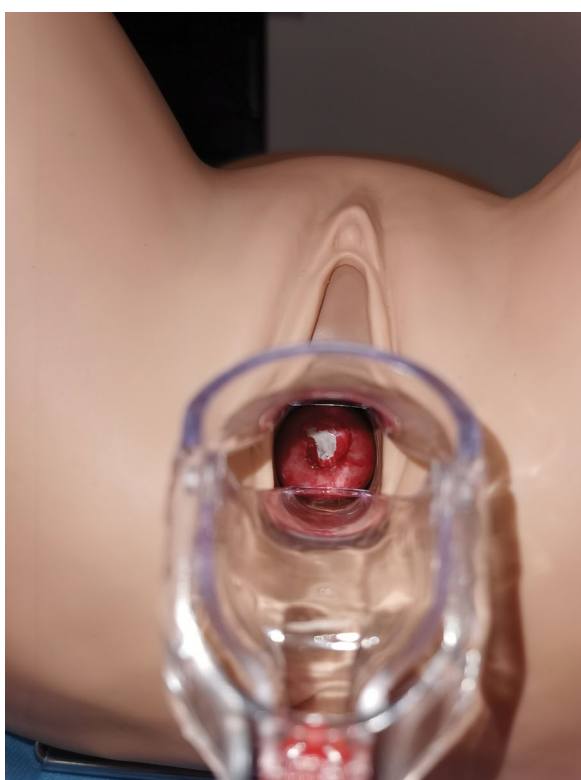
Figure 5. Speculum examination trainer — interior view

Student's work in the simulation room should take place without the teacher's direct presence. The person running the scenario should be in the control room and react to the student's activities by changing the simulator's vital signs. Possible negative consequences resulting from a mistake should occur during the scenario, so that the student is aware of them and has a chance to correct them. Concerning students' decisions, the priority is to make the scenario the basis for further reflection. Safe ways of making mistakes in simulated conditions without risking the health and life of patients is impossible in teaching at the patient's bedside.