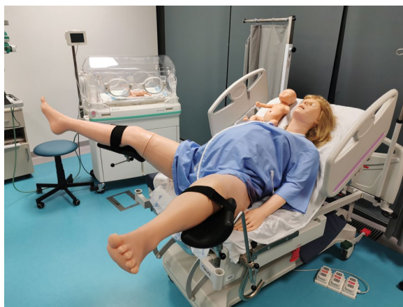
Figure 3. Human Patient's Simulator