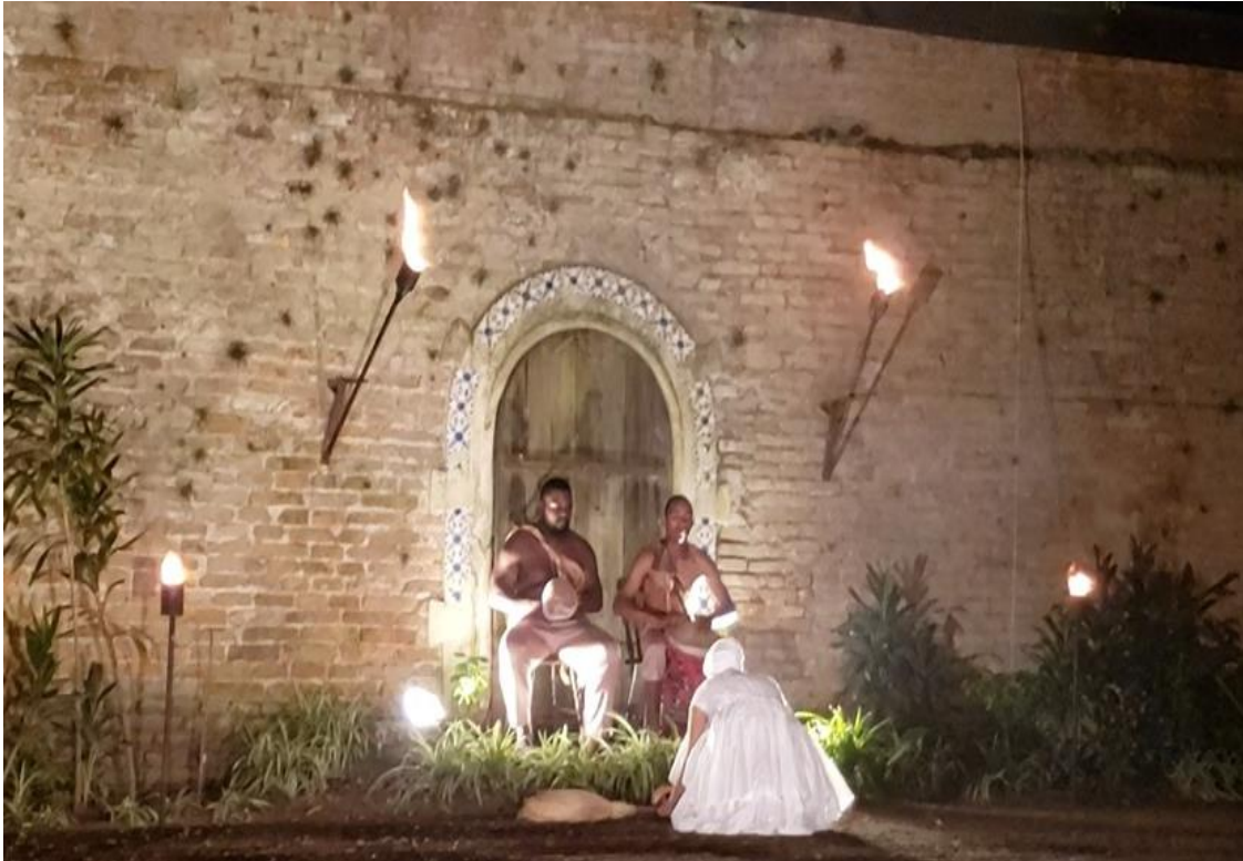
Figure 15 - The Final Bow

When all was said and done, I sobbed profusely. To be transparent, this performance moved me beyond my own understanding. Brown, Kuwabong, and Olsen (2014) in their book Myth Performance in African Diaspora , say the drums transport performers and the audience into a world of convergence, a place where possibility and hope counter against historical, socioeconomic, and political contradictions (Brown, Kuwabong, and Olsen 2014, 110). I truly have no words to express what it felt to be consumed with memories recollected and interpreted. As the shadows danced against the walls, I couldn't help but wonder if these shadows weren't actually the spirits of ancestors enlivened by remembrance and reverence. In her chapter on post-periphery performance, Dr. Simone Osthoff, a Brazilian-born artist and scholar and professor at Pennsylvania State University, discusses the hazards of binary models of art and history (Albuquerque and Bishop-Sanchez 2015, 250-268). Divided into that which is central and that