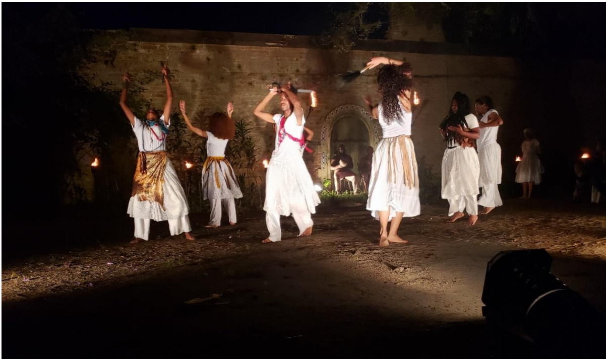
Figure 20 - A Picture Worth a Thousand Words Personal image, taken during 2019 fieldwork