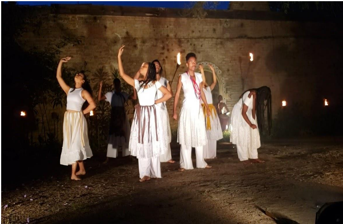
Figure 10 - The Essence of a Moment Personal image, taken during 2019 fieldwork

The last piece I will discuss here was the most encompassing of all components argued in this thesis. The performance, titled Dança dos Orixás and its locale, Charqueada São João entwined to portray the lived experience or collective memory of Afro-Brazilians in Pelotas (SEE Figure 10). A microcosm of Brazil, Pelotas has an African legacy that is given a cursory glance at most. The project, Dança dos Orixás , was created to celebrate and value African heritage and to reframe blackness and merge the Black history of the municipality with that of