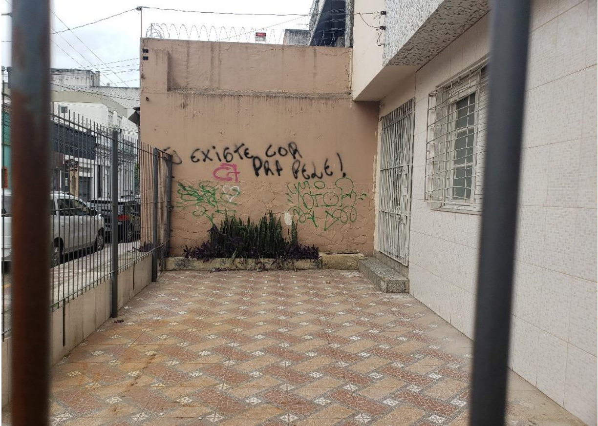
Figure 5 - Street Graffiti, “ Não Existe Cor Pra Pele! ” – “There’s no such thing as skin color!” Personal image, taken during 2019 fieldwork

obstacles to access and authorship faced by early Afro-Brazilian samba artists. Their mobility and visibility within the music industry already scant, artists’ success hinged on skin color (Hertzman 2013, 77). The implications of denied access to “public” spaces because of race due to “intellectual property systems designed by elites” for elites (Boyle 1996, 157) was discussed throughout this thesis, explicitly so in chapter three; I discussed the history of Black artists and samba in chapter two.