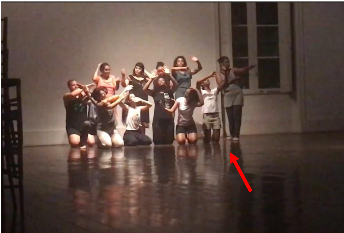
Figure 9 - Afro-Dance Workshop at the Public Library of Pelotas

critical was my mission to dive into Afro-dance and trace the hand the company has had in destabilizing and challenging the authority of the written word (Albuquerque and Sanchez 2015,