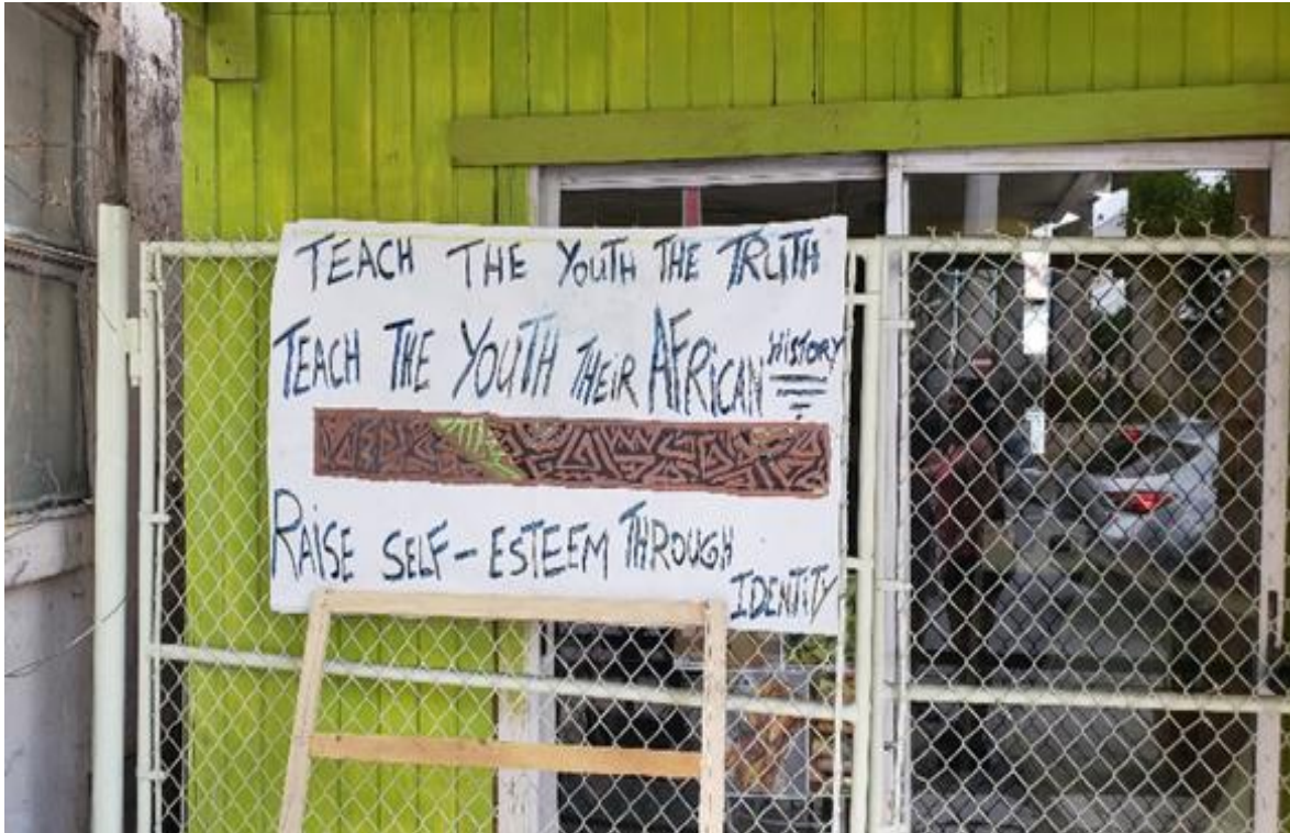
Figure 23 - Legacy of Africa in Barbados