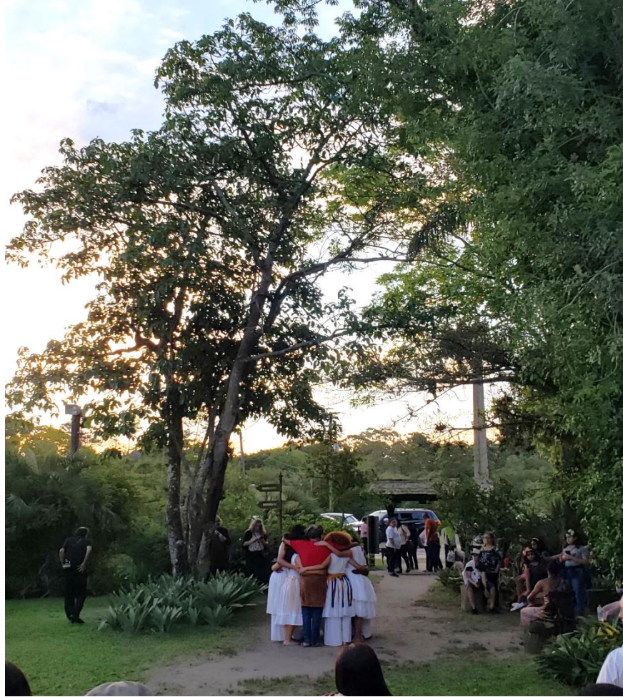
Figure 21 – Community Personal image, taken during 2019 fieldwork

If narratives demonstrate the way people see themselves in the fast-evolving yet ever so stagnant world (Kuhlke and Pine 2014, 98), then the who gets what, when, and where (Hanna 1979) is not only tied to sociality, it's a political endgame. The city of Pelotas, conforming to national patterns, minimizes and conceals the integral