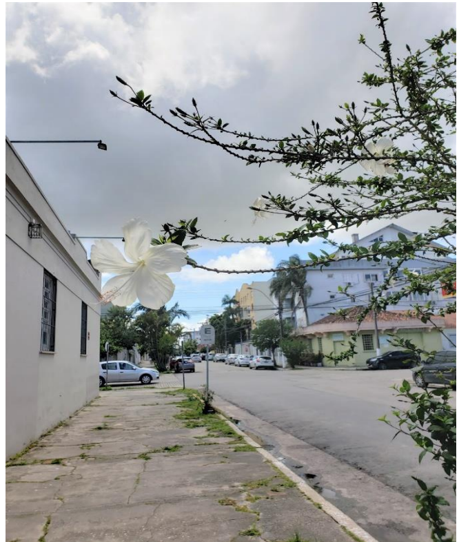
Figure 1 - H. Rosa Sinensis

Amid the chatter, Voice forte 6 I say: I am here and my name is Matter.