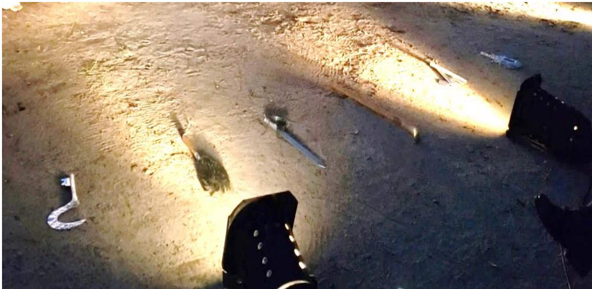
Figure 13 - Sacred Objects Personal image, taken during 2019 fieldwork

performance. After each dancer made their way to the “stage,” (SEE Figure 12) so began the dance aspect of the performance. The dancers remained stationary in a circular formation while Larissa marked the ground. Also, before the dancers, on the ground just in front of where they were to dance, there were renditions of the sacred object of each deity (SEE Figure 13).