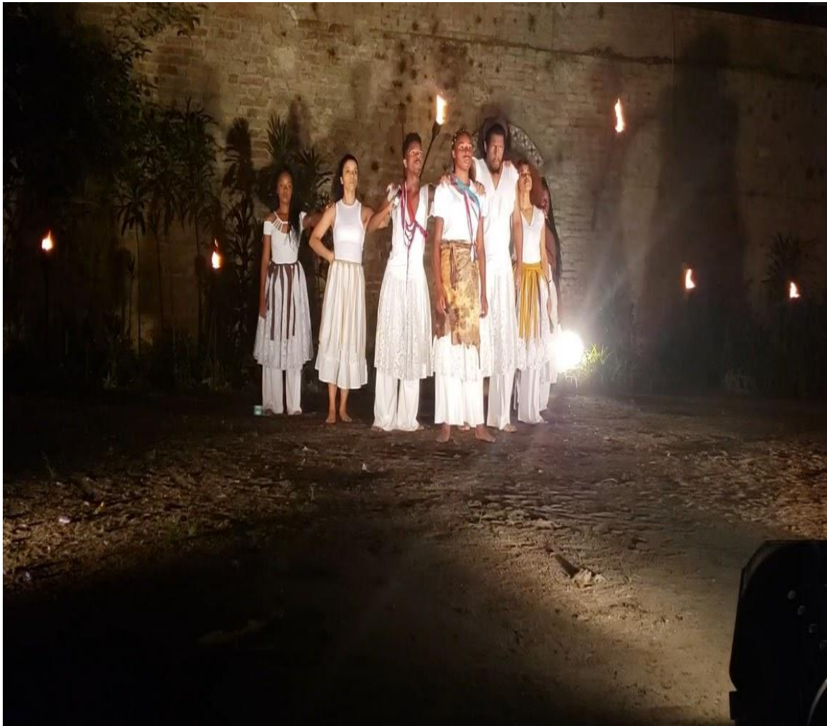
Figure 16 - United Front Personal image, taken during 2019 fieldwork