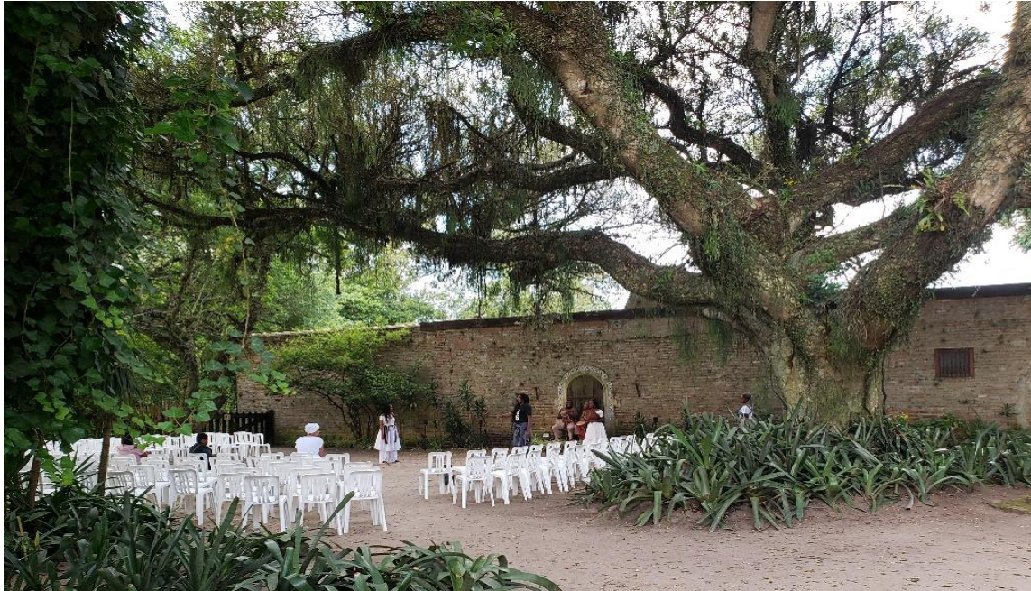
Figure 12 – Stage

performance. After each dancer made their way to the “stage,” (SEE Figure 12) so began the dance aspect of the performance. The dancers remained stationary in a circular formation while Larissa marked the ground. Also, before the dancers, on the ground just in front of where they were to dance, there were renditions of the sacred object of each deity (SEE Figure 13).