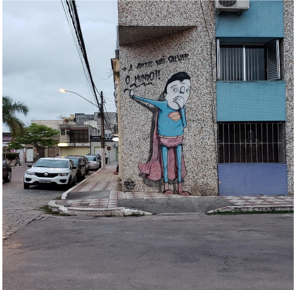
Figure 22 - “A arte vai salvar o mundo!!” – “Art will save the world!!”

will further the efforts of those past to bring dance and performance to the forefront of sociological and political evaluations. Not only does dance inflect history through diachronic storytelling, it is an archive of