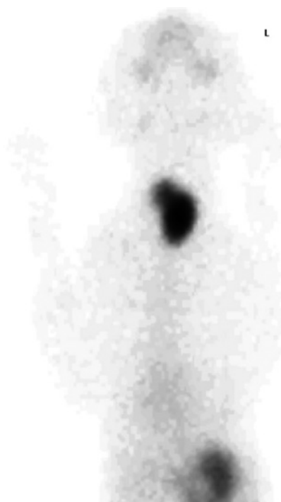
Figure 1. Pertechnetate scan in a hyperthyroid cat prior to 131 I treatment.

performed as part of an extensive work-up for a prospective study.