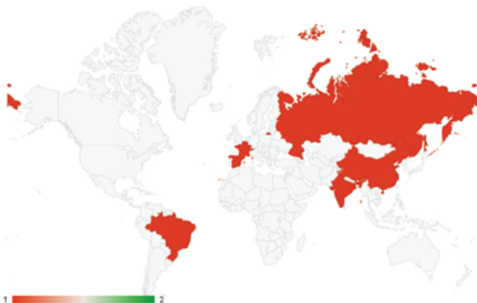
Figure 1. Showing countries reporting cases of COVID 19 and TB coinfection.

These 8 studies cumulatively reported 80 patients with COVID -19 in the background of TB. Seventy patients were reported to have active pulmonary tuberculosis at the time of COVID – 19 diagnosis. Most of these reported cases had been recruited from nine countries and three continents, mostly by the Global Tuberculosis Network. (10,11,18) Figure 1 shows the different countries with reported TB and COVID- 19 coinfection. To date, Countries reporting TB and COVID cases have been Belgium, Brazil, France, Italy, Russia, Singapore, Spain, Switzerland, India and China. Among these Italy has reported the highest percentage of cases (51%). With the recent upsurge of cases in developing countries, we can anticipate a rise in the numbers of patients with TB and COVID -19 coinfection. TB and COVID coinfection has been reported across both genders and different age groups. COVID 19 co-infection has been reported in TB patients before diagnosis, after diagnosis, and during