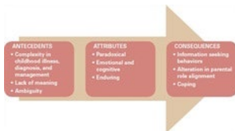
FIGURE 2.: Diagram of Antecedents, Attributes, and Consequences