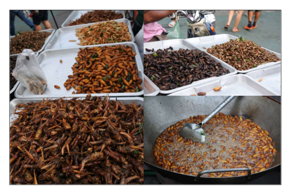
Figure 3. Edible insects sold in Thailand.

et al., 2012; Kitisin et al., 2015). The pigmented rice is milled, just like white rice, however, the milling process is only done to remove the husk or hull, leaving the bran layer, germ and endosperm intact (GRiSP, 2013). The USDA Foreign Agricultural Service Office of Global Analysis (2019) estimated that four ASEAN members belong to the top 10 highest rice producers of the world, with Indonesia ranking 3<sup>rd</sup>, followed by Vietnam (5<sup>th</sup>), Thailand (6<sup>th</sup>), and lastly, the Philippines (8<sup>th</sup>), and although different pigmented rice varieties are available in the region, their utilization and consumption are still wanting.