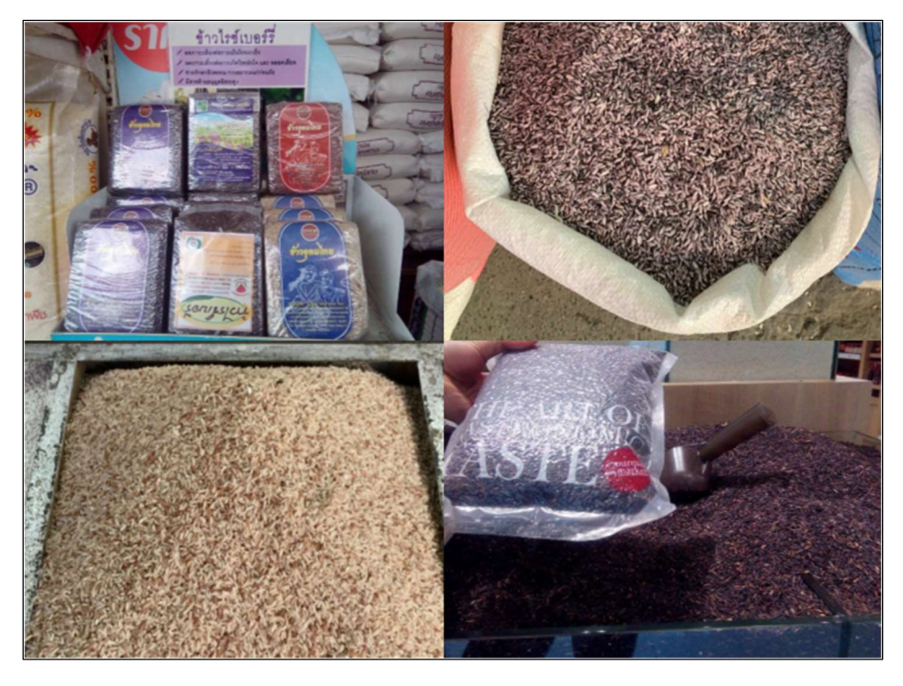
Figure 4. Pigmented rice in various colors.