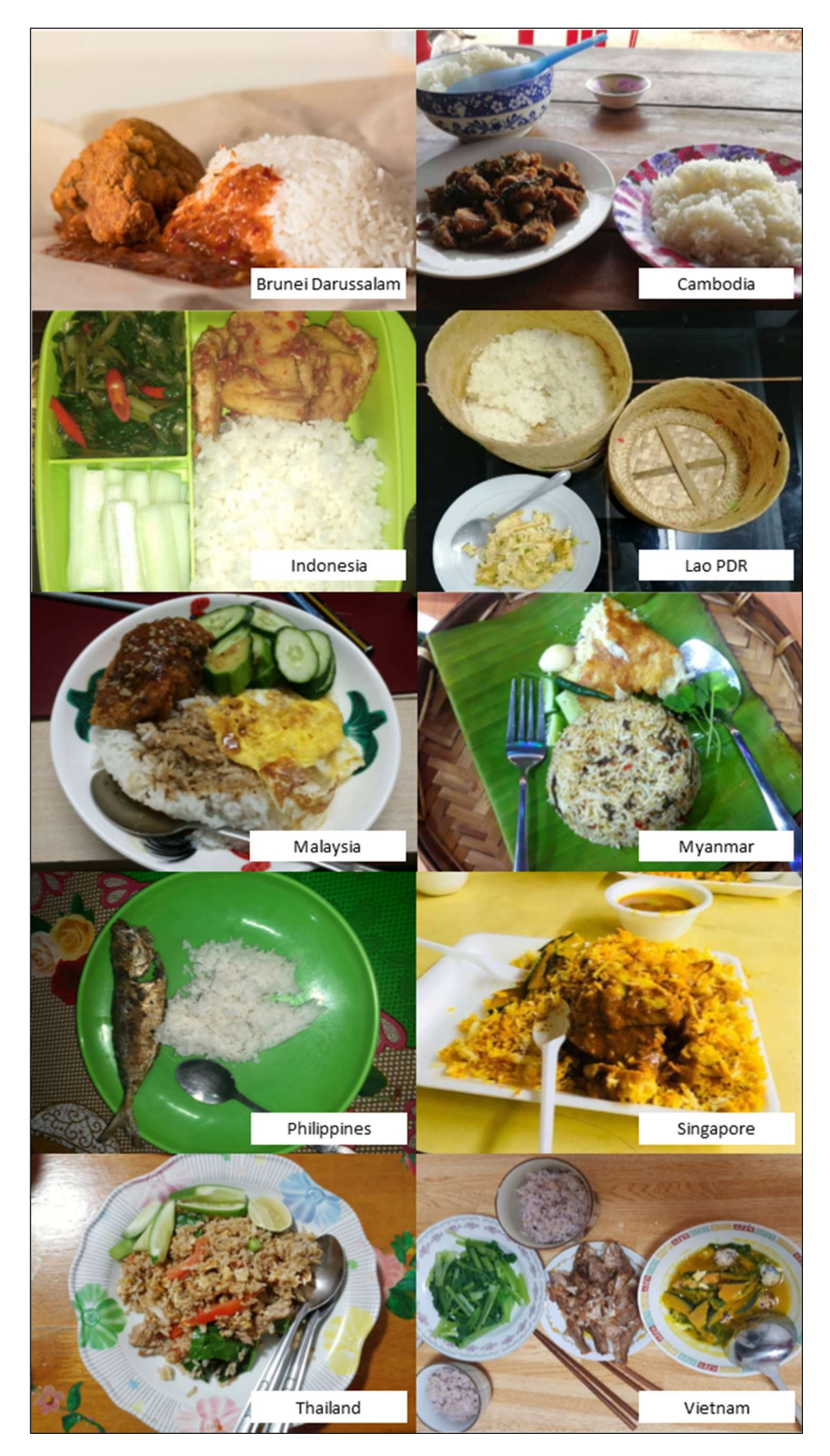
Figure 2. The typical meals in the ASEAN region.