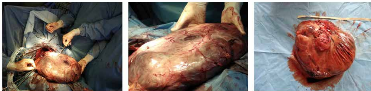
Fig. 1. Gastrointestinal stromal tumor of stomach.

the secondary changes in the tumor, the phenomena of pronounced myxomatosis, hemorrhages, foci of necrosis and hyalinosis were noted. Mitotic activity was low – less than 2 in 50 fields of view (Fig. 2).