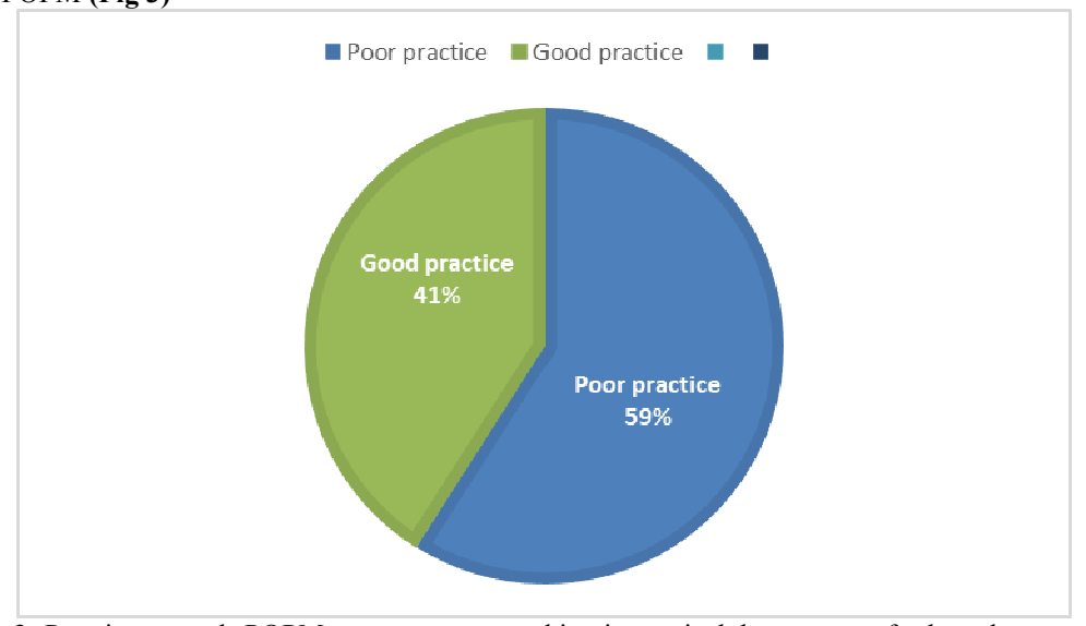
Figure 3: Practice towards POPM among nurses working in surgical department of selected governmental hospitals in Addis Ababa, Ethiopia, 2019(n=169)

The nurses were considered as having good practice if they scored \geq 70% out of 10 in the practice assessment questionnaire. The nurses were considered as having poor practice if they scored less than 70%. The result reveals that 99(59 %) of surgical nurses have in adequate knowledge and 70(41%) have adequate practice regarding POPM (Fig 3)