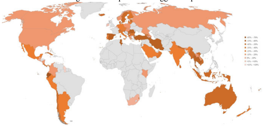
Figure 2: Countries international tourist Distribution.

2020). In initial may, three possible scenarios were suggested by UNWTO which shows the reduction in the entire international arrivals from 58 percent to 78 percent, depending on when the restrictions will be removed. In the middle of May when traveling resumes there is an increase in the amount of international arrivals increases. This includes the introduction of some extra safety and policies that were established regarding hygiene and safety aim to resume domestic traveling as well (World Tourism Organization, 2020b). Australia, New Zealand, Europe, Southeastern Asia Southern are those regions that experienced biggest drop in the international tourism