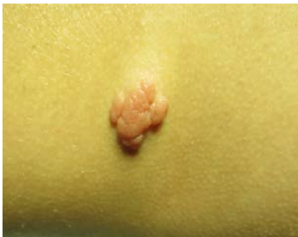
Figure 1. Nodular mass of an isolated plexiform neurofibroma on the flank.

On examination, a 1.8×1.6 cm large, slow-growing, and asymptomatic exophytic asymptomatic tumor was observed on the right flank (Figure 1). The primary suspicion was a complex nevus tumor type such as nevus sebaceous or nevus lipomatosus. The tumor was surgically removed, and the defect was closed by tissue expansion. Histology revealed a spindle-cell proliferation of S-100 positive cells without cellular