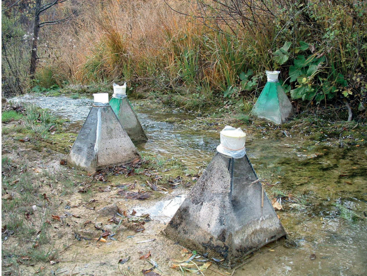
Fig. 2. Emergence traps at the Korana River site in Korana village.

Family: Hybotidae Meigen, 1820 Subfamily: Tachydromiinae Meigen, 1822 Tachypeza yinyang Papp & Földvári, 2002 Figs 3 – 4.