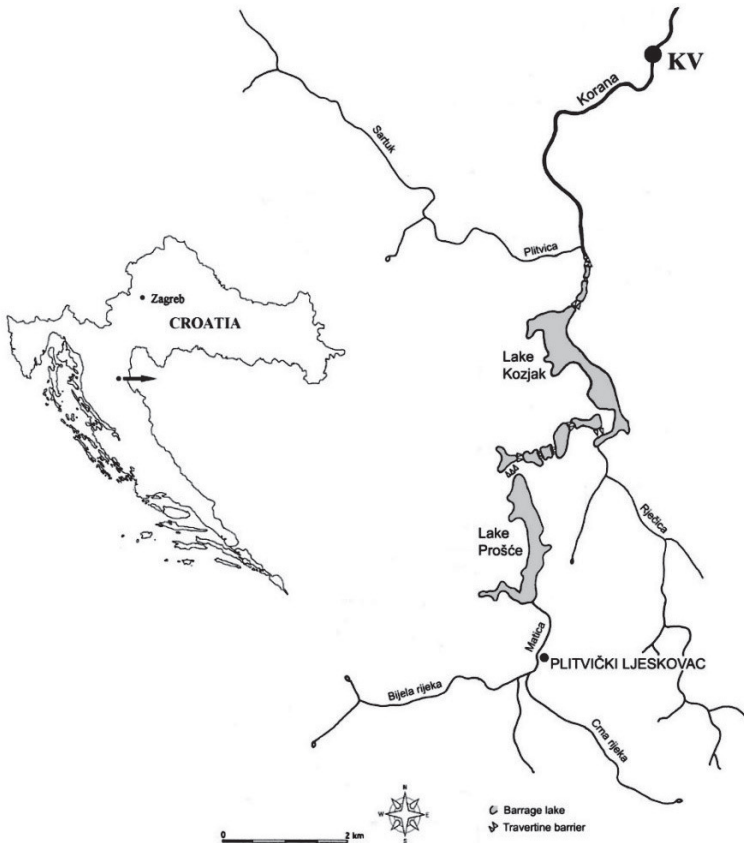
Fig. 1. Map of the study site: Korana River in Korana village (KV).

The single male was collected in an emergence trap set-up at Korana River in the village of Korana (Fig. 2). Six pyramid-type emergence traps were operated from February 2007 to February 2009. Traps were sited in such a way as to ensure representative sampling of emergence from all microhabitats present at each site. Each trap was a 50 cm tall, four sided pyramid with a base of 45×45 cm, fastened to the streambed to allow the free movement of larvae in and out of the sampling area. The side frames of the traps were covered with 1-mm mesh netting (Ivković et al. , 2013). The site completely dried out in the summer months of 2007 (July – mid September), but not in 2008.