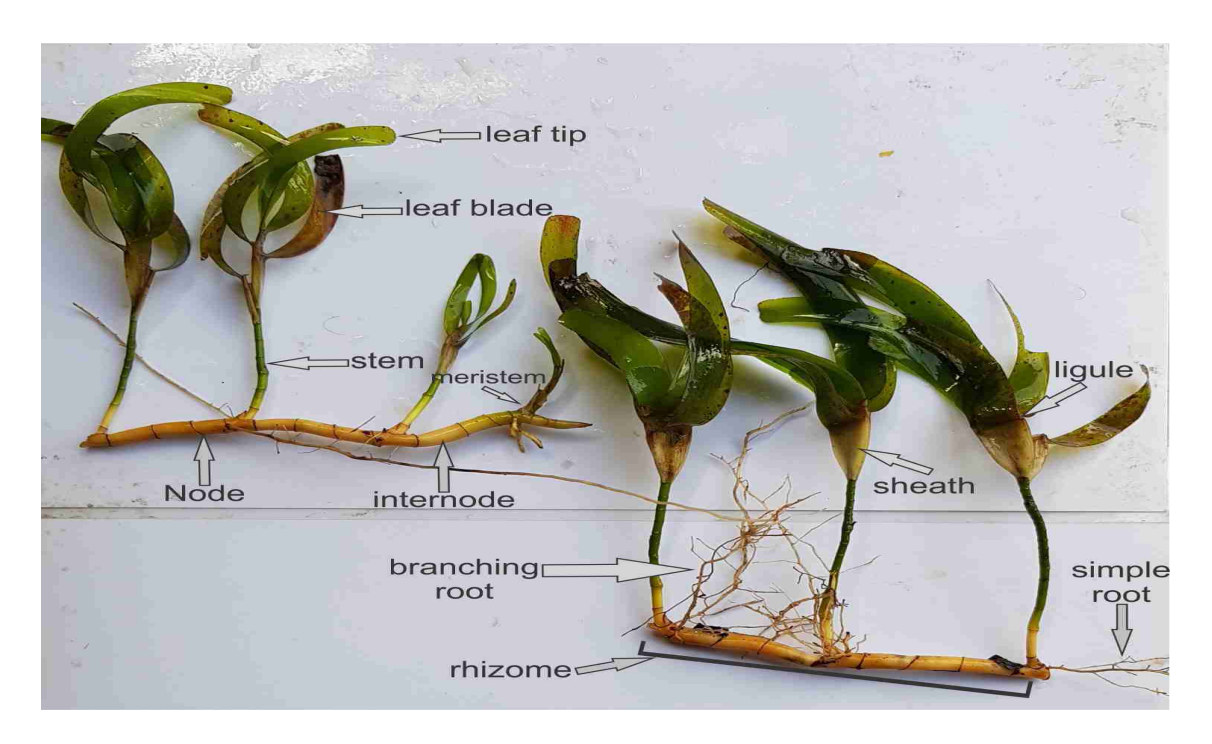
Fig 3: Schematic diagram of seagrass with different parts.

The vast seagrass beds were present in Palk bay and Gulf of Mannar between mainland and islands and towards seaward side from the islands. The seagrass species, Haloduleuninervis is extensively distributed in Gulf of Mannar and is one of the dominant and primary species in the intertidal belt. It occurs both on sandy and muddy substratum with a thin layer of sand. H.uninversis plays an important role both as stabilizers andsediment accumulator and occurs either as a bed of monospecific community or a mixedvegetation with Cymodocearotundata , Cymodoceas errulata, Halophila ovalis and Enhalusacoroides . Cymodoceaserrulata occurs extensively in most of the islands of Gulf of Mannarand forms a significant browsing ground for the endangered dugong. Thalassiahemprichii and H. uninervis beds are the important habitat for Holothurians commonly known as seacucumbers.