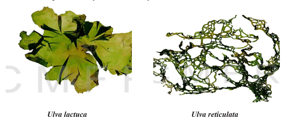
Fig 2: Some important seaweed species are listed below.

These seaweed resources are available in abundance only in shallow areas around the gulf of mannar islands. G.edulis produces edible quality agar and it has grown in any shallow waters on soft substratum such as clay. Gelidiella acerosa is available only around corals area of gulf of mannar islands.