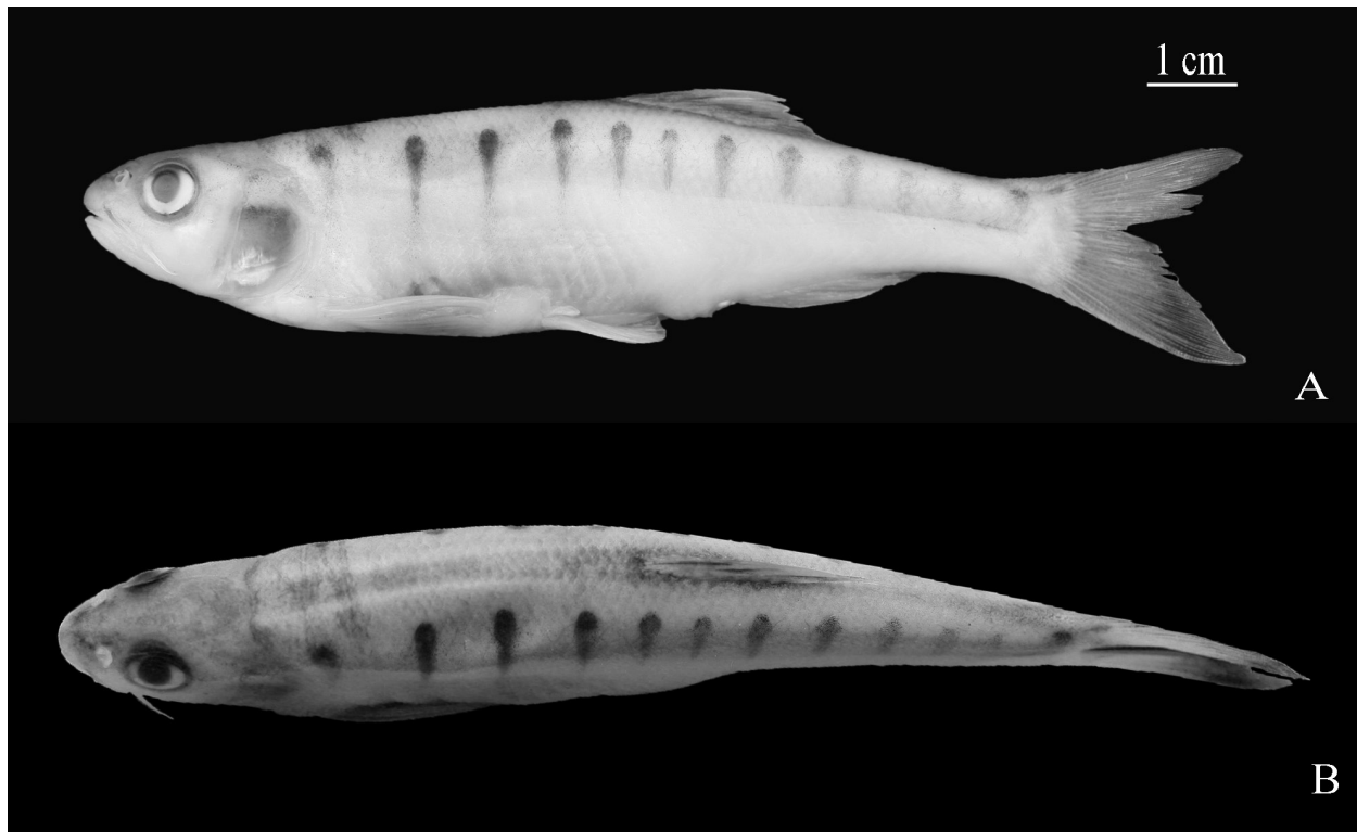
Image 1. Holotype of Barilius torsai sp. nov. (ZSI FF5542; 71.41mm SL): A—lateral view | B—dorsal view.