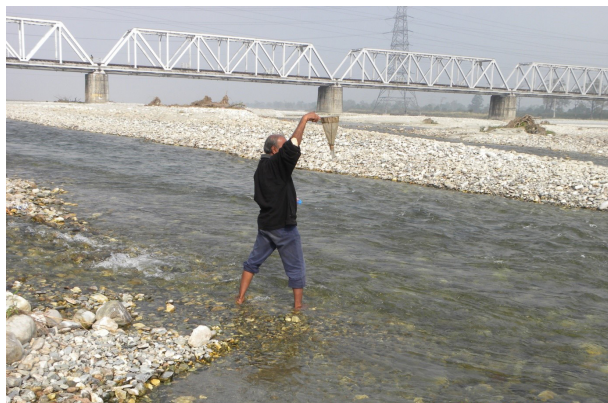
Image 2. Torsa River, Jaldapara, West Bengal, habitat of Barilius torsai sp. nov.