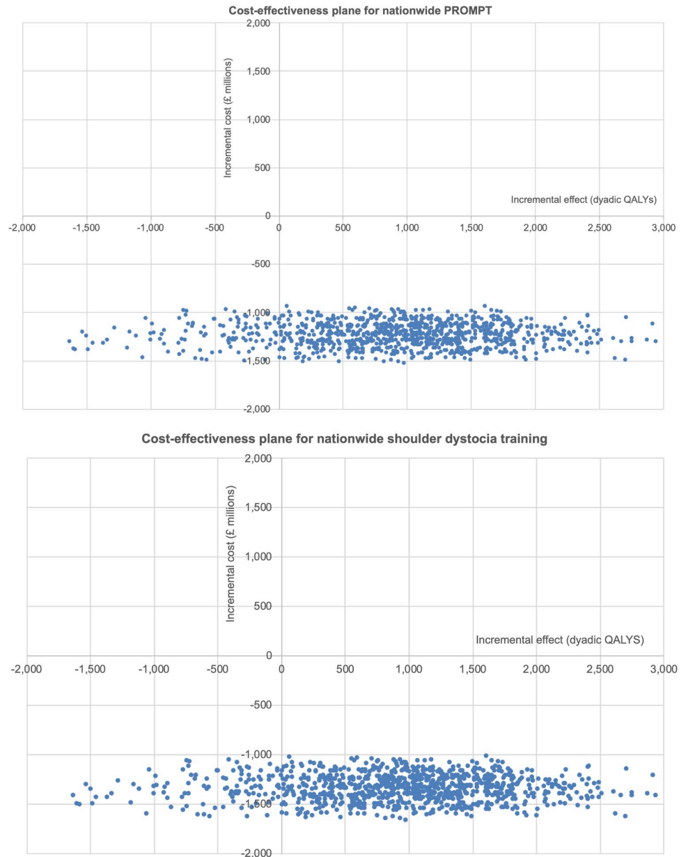
Fig 2. Cost-effectiveness planes for nationwide PROMPT (scenario 1a) and nationwide shoulder dystocia training (scenario 1b) using dyadic QALYs.

https://doi.org/10.1371/journal.pone.0249031.g002