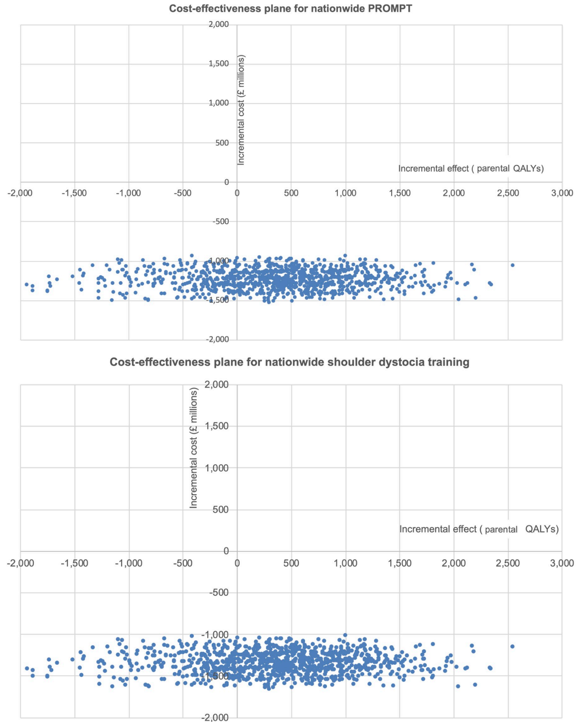
Fig 4. Cost-effectiveness planes for nationwide PROMPT (scenario 1a) and nationwide shoulder dystocia training (scenario 1b) using parental QALYs.

https://doi.org/10.1371/journal.pone.0249031.g004