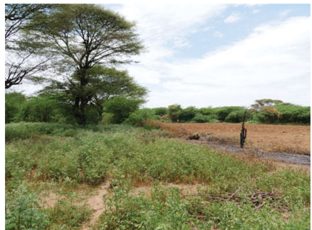
Figure 3. The site of Ilchamus Lekeper as seen from the central cattle pen in (a) September 2014 and (b) March 2020 (looking northwest). The ground, almost completely barren between 2014 and 2017, has now been densely covered by shrubs and forbs due to increased rainfall in 2019 and 2020.

significant variability. Ilchamus elders recall stories of people walking to the island of Ol Kokwa at the centre of Lake Baringo, as well as the lake filling up due to intense rains during the Ipeles (c. 1865–1877) and the Ilkileko age sets (1901–1913). 4 European travellers stopping at Ilchamus settlements in 1883, 1887–88 and 1893 described famines and droughts (Gregory 1896; Thomson 1885; von Höhnel 1894), and sediment records from Lake Bogoria and other nearby lakes indicate drought conditions around 1870 with a short highstand at the start of the twentieth century (De Cort et al. 2013; Driese et al. 2004; van der Plas et al. 2019).