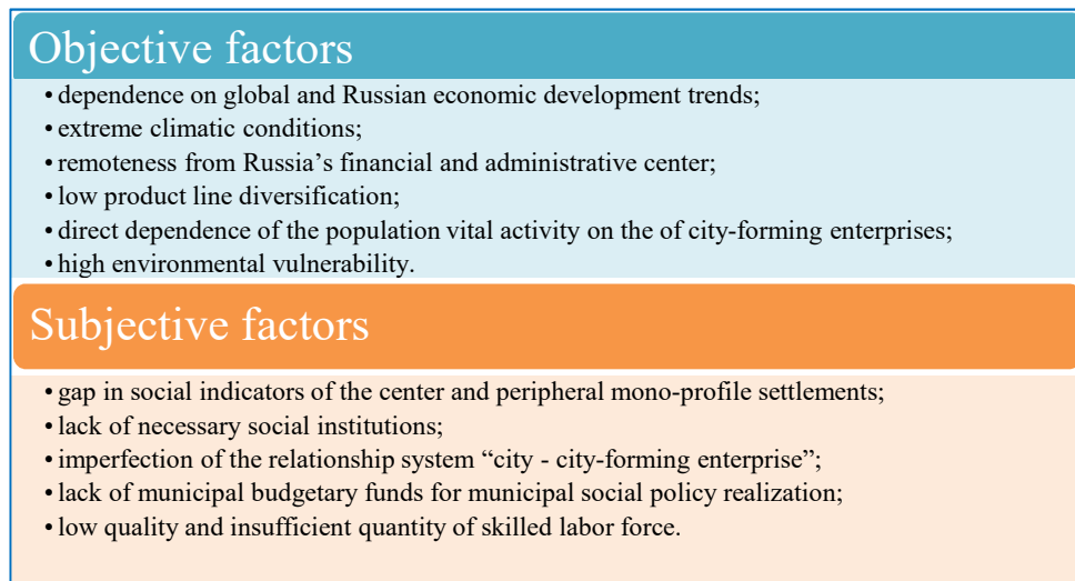
Fig. 3. Groups of objective and subjective factors that increase social tension in single-industry cities of the Russian Arctic.

In the course of the studying of the mono-industrial cities of the Russian Arctic, we have come to the conclusion that social tension in these cities is increasing. We have identified a number of factors that denote this. Among them, there are factors that in a varying degree are inherent in all mono-industrial cities of the Arctic. We have called them objective. Another group of factors is associated with imperfection of municipal administration and is noted only in some mono-industrial cities. We have called these factors subjective. The groups of objective and subjective factors are presented in Figure 3.