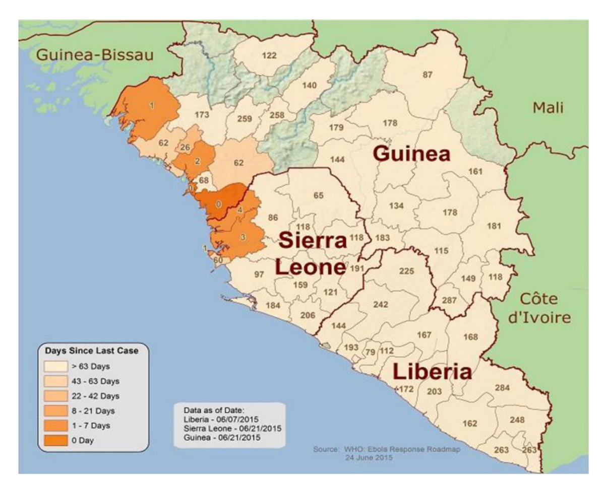
Fig. 2 Map of the West African region showing the number of days passed since the last case reported to the World Health Organization. Last updated 24 June 2015. Reprinted from the Ebola Response Roadmap. Map of

West Africa showing when the last cases of Ebola occurred. 24 June 2015. http://www.cdc.gov/vhf/ebola/outbreaks/2014-west-africa/distribution-map.html. Copyright 2015