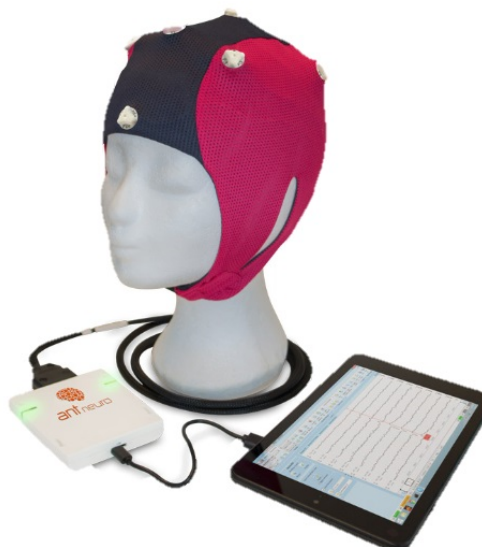
Figure 2. The ANT Neuro eego mini-series and ANT Neuro waveguard touch.

The ANT Neuro eego was selected from a shortlist of commercial devices. Following Pinho and colleagues' work [29], an EEG system used for clinical purposes in outpatients must meet 9 requirements: wireless connectivity, dry electrodes, signal resolution, sampling frequency, comfort, portability, signal artifact attenuation, event detection, and event prediction. Neumann et al [27] also added the necessity of an integrated and structured reporting system and full coverage of the 10-20 System of electrode placement. The ANT Neuro eego meets several of these technical demands required for a clinical outpatient EEG system but not all of them. Technical specifications of the device compared with other available devices are also summarized in Table 1.