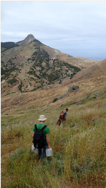
Figure 3. doi

Forest habitat Plot 3 of Madeira island.