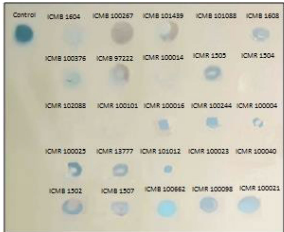
Fig. 1 Representation of ficin protease inhibitor (PI) activity of seed proteins using X-ray dot blot assays. The unhydrolyzed gelatin in the spotted area indicates the presence of PI activity

ICMB 101439) and Pg 186 (13% with ICMR 100023; data not shown).