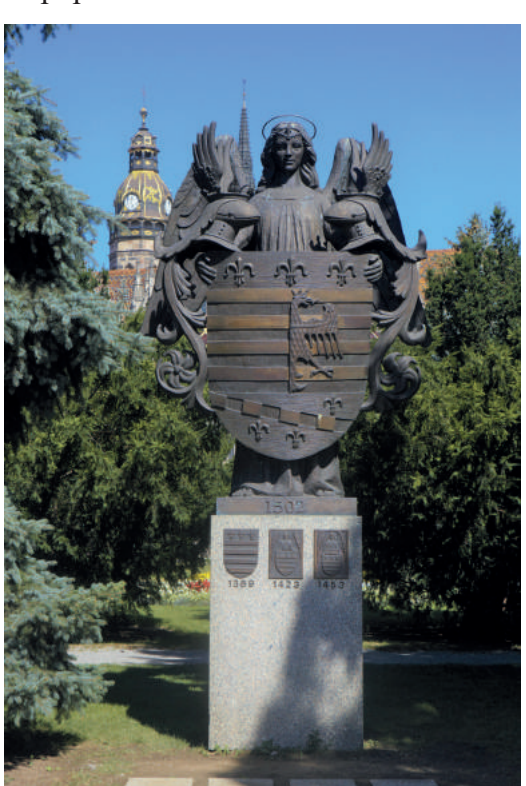
The statue of the municipal coat of arms of Košice inaugurated in 2002.

Košice lost its multi-ethnic character because of the war, forced migrations, urbanization and assimilation in the 20th century. Today, Košice has 240,433 inhabitants and the vast majority of them are Slovaks. According to the official census of 2011 73.8% of the population declared to be Slovak, 2.65% Hungarian and 2% Romani. However, we need to keep in mind that, as a reflection of the complex story of communal boundaries outlined above, 19% (45 972) of the population did not declare their ethnic affiliation.<sup>16</sup>