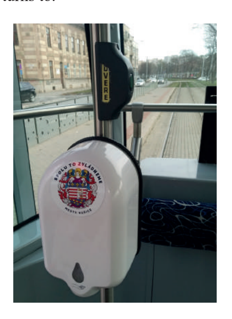
Hand sanitezer on Tram no. 7 of Košice.

However, it is important to note here that this historical event did not play an important role in shaping the new Slovak identity of Košice after 1993, even if today a housing estate still bears the name of this government program. What were the constituents of post-1993 memory, then? This is the question that the next section turns to.