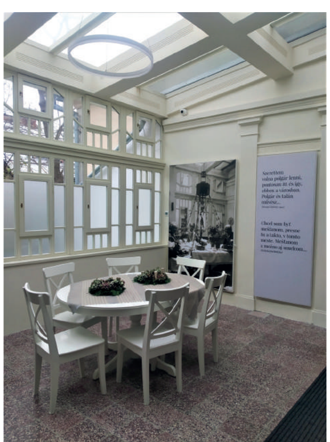
The Sándor Márai Memorial Exhibition in Košice.