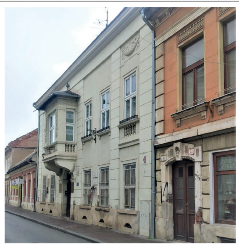
The building of the Sándor Márai Memorial Exhibition in Košice.