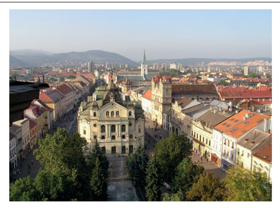
View from the Cathedral of Košice.