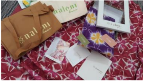
Fig. 1. Naleni fabric branding: paper bags, packaging boxes, brochures, catalogs, price tags.