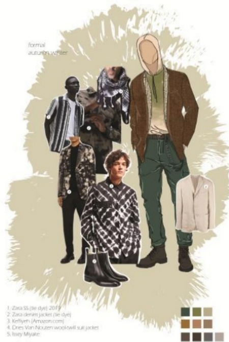
Fig. 9. Blazer based on Neo-Medieval theme.

options are available in the market. So, in Surabaya, both types tend to have niche markets.