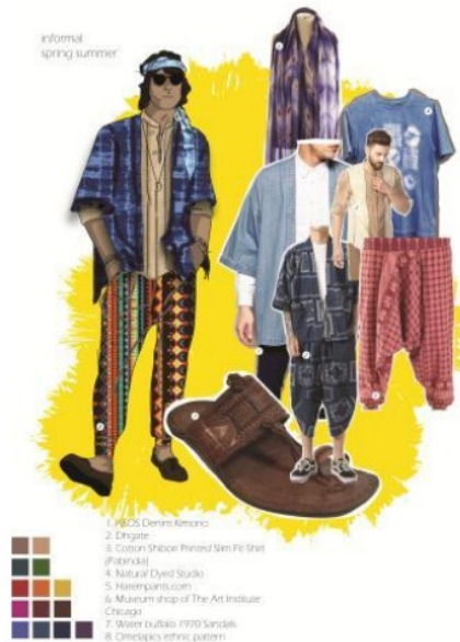
Fig. 7. Kimono design based on the Svarga theme.

Svarga could be translated into relaxing, freedom, and earthy. The overall appearance is similar to the hippies or boho styles of the 1970s. Vibrant motifs, colliding shapes, and colors, loose silhouettes of clothing, and light, loose fabrics are key to the look. However, the Svarga design here is kept simple and the colors are not flashy. For women, the top design is in a tie-dye pattern in indigo blue with a square silhouette. The sewing pattern for this loose-rectangular silhouette is easy to make, thus economical and efficient and will speed up the production time. 1.5 meters of cloth is needed for the top. The price is around IDR 199,900. Size availability would be in S, M, L.