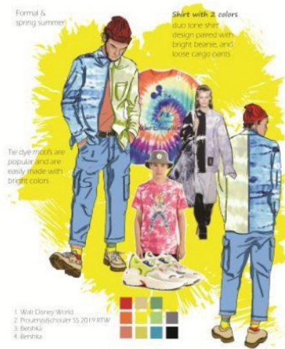
Fig. 4. Shirt design based on the Exuberant theme.

The Exuberant mood board is based on adjectives such as energetic, optimist, positivity, and dynamic. These are represented in bold color scheme, and geeky-retro-quirky mix and match. The basic characteristics are shown in asymmetrical silhouette and two colors in one garment. The women’s kimono design tends to be in neutral tones, using beige and gray in its collar. The collar shape is in the New Age Zen theme, in harmony with asymmetrical wrap-skirt. Kimono material is shibori made by wooden clamp technique resulting in a large easy-to-made pattern. Meanwhile, tie-dye is used for the skirt pattern incorporated with plain blue fabric. Kimono and wrap skirt are matched with a white shirt and bold colored socks to achieve a geometric, dynamic, and optimistic impression in a Japanese way. The men’s shirt comes in two-tones as well, blue and green in a tie-dye pattern. The shirt can be converted into long shrugs by using a t-shirt as inner matched with jeans cargo pants, a red beanie hat, colorful socks, and a pair of boat shoes. The shirt comes in S, M, L gradings. The overall look should be nerdy, odd, and retro.