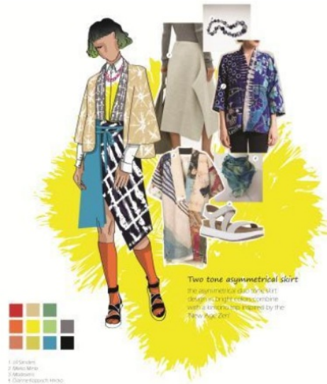
Fig. 5. Kimono and skirt design based on the Exuberant theme.

The Exuberant mood board is based on adjectives such as energetic, optimist, positivity, and dynamic. These are represented in bold color scheme, and geeky-retro-quirky mix and match. The basic characteristics are shown in asymmetrical silhouette and two colors in one garment. The women’s kimono design tends to be in neutral tones, using beige and gray in its collar. The collar shape is in the New Age Zen theme, in harmony with asymmetrical wrap-skirt. Kimono material is shibori made by wooden clamp technique resulting in a large easy-to-made pattern. Meanwhile, tie-dye is used for the skirt pattern incorporated with plain blue fabric. Kimono and wrap skirt are matched with a white shirt and bold colored socks to achieve a geometric, dynamic, and optimistic impression in a Japanese way. The men’s shirt comes in two-tones as well, blue and green in a tie-dye pattern. The shirt can be converted into long shrugs by using a t-shirt as inner matched with jeans cargo pants, a red beanie hat, colorful socks, and a pair of boat shoes. The shirt comes in S, M, L gradings. The overall look should be nerdy, odd, and retro.