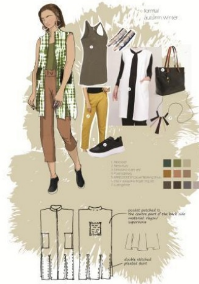
Fig. 8. Long shrugs based on the Neo-Medieval theme.

The design for the men's Neo-Medieval theme is a denim blazer with a collar that uses a different fabric. In order to make the Neo-Medieval look more visible, this blazer is styled with a sweatshirt, cargo pants, and boots. The selling price is around IDR 399,000.