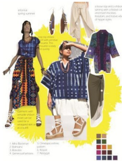
Fig. 6. Design top based on the Svarga theme.