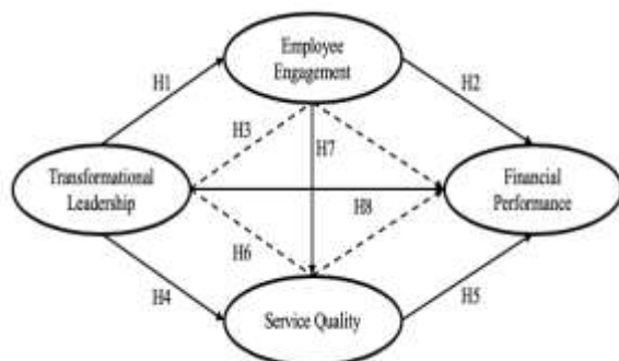
Figure 1. Proposed Research Model

H8: Transformational leadership affects financial performance.