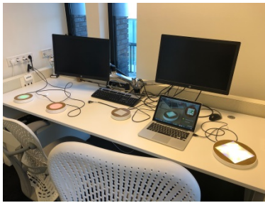
Figure 3: Research setup of the lab study