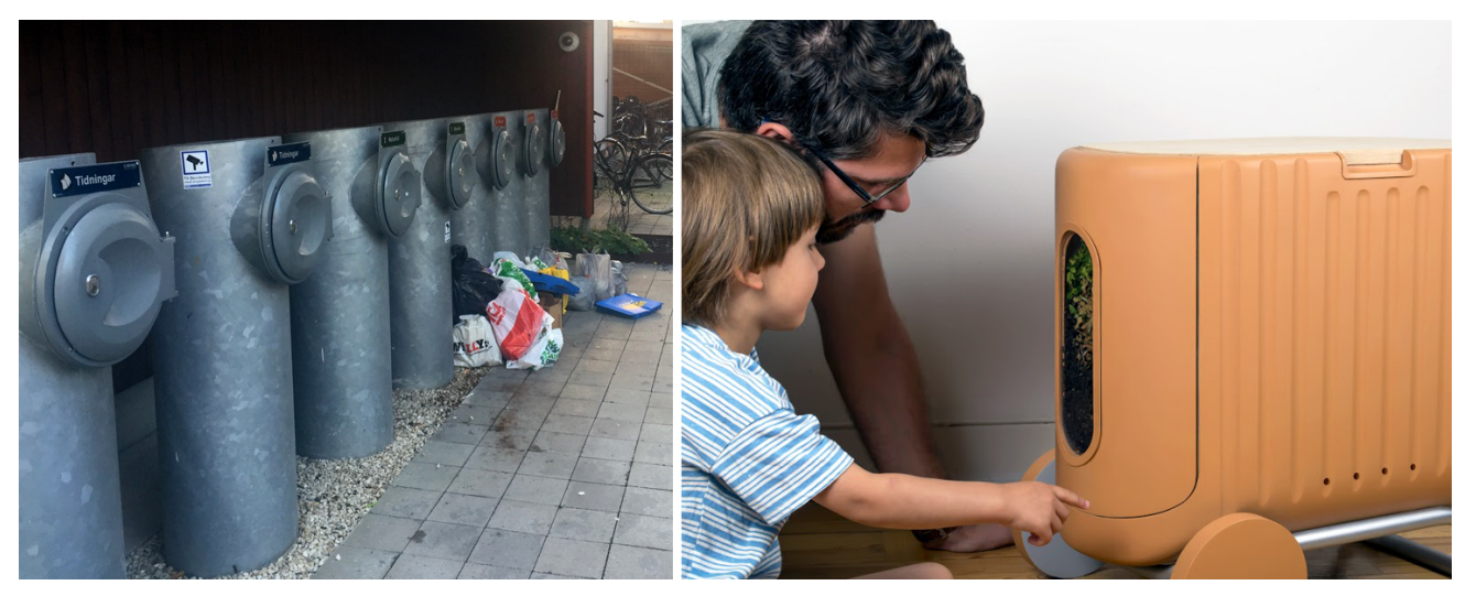
Figure 1a. A vacuum system for waste management in Kvillebäcken, Gothenburg. 1b. Super Local Heating.

That large-scale waste management systems can be constructed to be efficient (and sustainable) is very much a matter of what system boundaries are used, what time horizons are considered, and what sustainability aspects are recognized. Juxtaposing the eco-modern idea of efficiency suggests an alternative problem representation that revolves around the super-local and smallscaled, and where resource flows are within the horizon of the everyday. Translating this to material form resulted in the compost bench (Molander, 2018; see Figure 1b), designed to resemble a radiator that can easily be moved around. The composting process serves several purposes, the most obvious being the transformation of leftovers into soil that can be used for growing new food locally. This process however also generates heat (up to 75 °C)—a resource that in Swedish urban areas is typically produced through incinerating waste. This design speculation thus affords a much more direct relation to waste—heating and soil for householders helping to shift the perceived value of certain resource flows and what is considered waste.