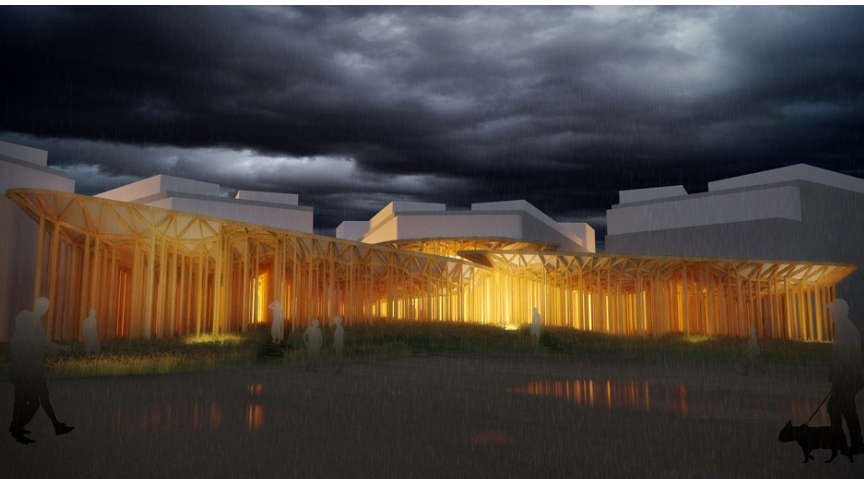
Figure 3a. A 'smart' shower application ready for an informed user. 3b. A communal bathing facility.

own. Emphasizing communal subject positions over individual ones, this speculative design presents a communal bath house (Figure 3b). The building caters to several rituals connecting to water and cleaning that are social rather than individualized. The structure and interiors are designed to reduce water consumption but also to enrich the experience of maintaining cleanliness.