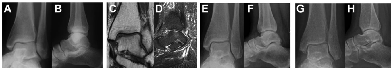
Figure 4. Images for a 56-year-old woman (case no. 18). (A, B) Initial radiographs without any detectable osteochondral lesion of the talus (OLT); the ankle joint shows no osteoarthritic changes. (C, D) Magnetic resonance imaging scans reveal an OLT at the medial talar dome. (E, F) Unchanged radiographs at midterm follow-up. (G, H) Long-term radiographs show development of grade I osteoarthritis after a 14-year follow-up.