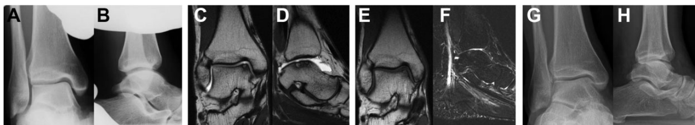
Figure 3. Images for a 28-year-old man (case no. 12). (A, B) Initial ankle radiographs, suspected of an osteochondral lesion of the talus (OLT) at the medial talar dome and no osteoarthritic changes. (C, D) Initial magnetic resonance imaging (MRI) scans confirm OLT diagnosis. (E, F) MRI scans at midterm follow-up show a slight decrease in size of the lesion. (G, H) Long-term radiographs show a persistent OLT and no osteoarthritis after a 15-year follow-up.