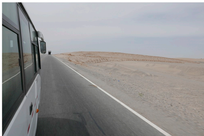
Fig. 4. The road connecting Charklik with the Qinghai Province to the east.

Agnieszka: We are in the middle of a desert, not many people live here, why would you need an expressway?