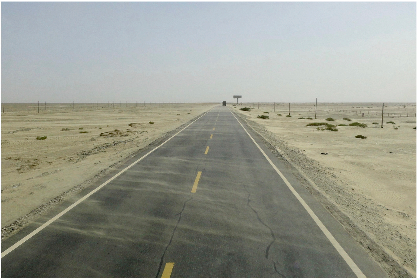
Fig. 3. The national highway no. 218 between the 34th military farm and Charklik. Photo: Author, 2012.

road out of bricks, which could be produced locally (XJSBW, 1998, p. 158). Kilns were thus hastily built and, as the construction proceeded, thousands of trees growing along the lower Tarim River – mainly poplars, tamarisks and saxauls – were felled to heat the ovens. The roughly 100 km brick road has since been praised in local annals as a brilliant example of drawing on indigenous materials and knowledge in modern road construction (XJSBW, 1998, p. 159). In terms of its environmental ramifications, however, the decimation of the forests growing along the Tarim still reverberates throughout the whole of southeast Xinjiang. The felling of the forests, through which the road was actually built for its protection from the sun, wind and sand, also had disastrous consequences for its further maintenance. 13