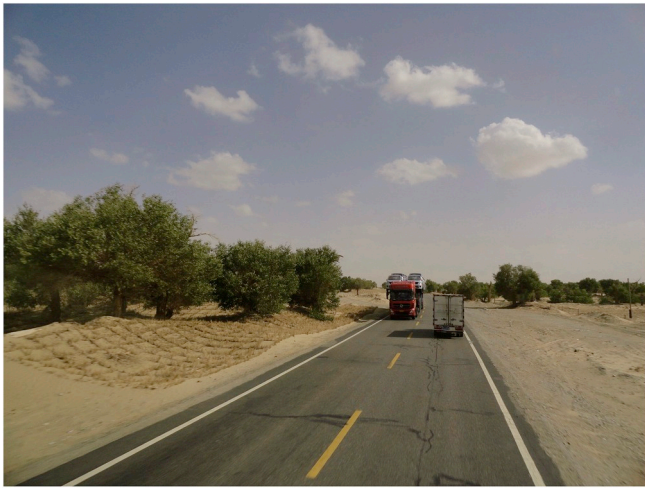
Fig. 6. Euphrates poplars together with reed grids stuck in the sand should keep the sand from encroaching onto the road.

launched politically and ecologically controversial projects of large-scale Han Chinese settlement, land reclamation and irrigated cotton agriculture in southern Xinjiang, water consumption has soared. Within fifty years, the amount of water used for irrigation increased exponentially from 5 to 20.2 billion m 3 (Chen, Ye, & Shen, 2011, pp. 264–6).