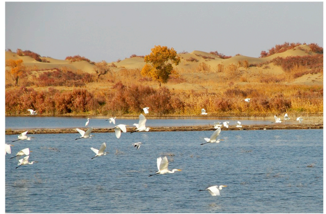
Fig. 7. An idyllic view of Tarim, when the water flows.

The Tarim Management Office – the agency that coordinates the project – celebrates the Ecological Water Diversion project as a victory for the ecologically sensible state, boasting that the forests have recovered and improved, the salinity of groundwater and desertification decreased, and the problem of sand encroaching onto the road ‘has