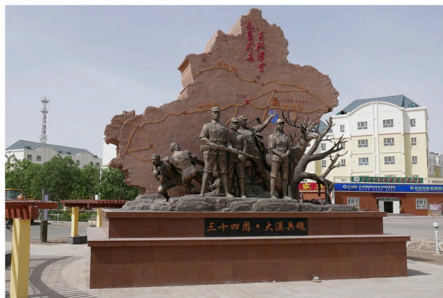
Fig. 5. Monument celebrating the pioneers of the 34th military farm erected at the roadside in the central settlement of the farm, facing the road. In the background, newly-built apartment houses along the main street leading into the settlement.

As the roadside undergoes a significant redecoration, the Chinese central government is placing growing expectations on the desert road