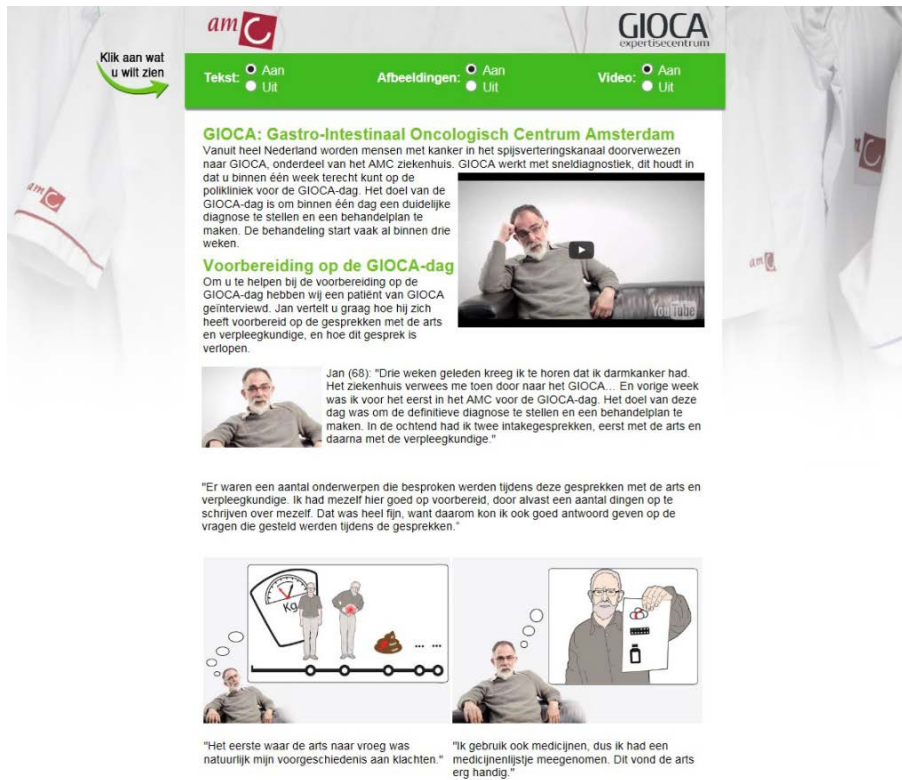
Figure 1a. Customisable website (text, illustration and video mode selected), male patient.