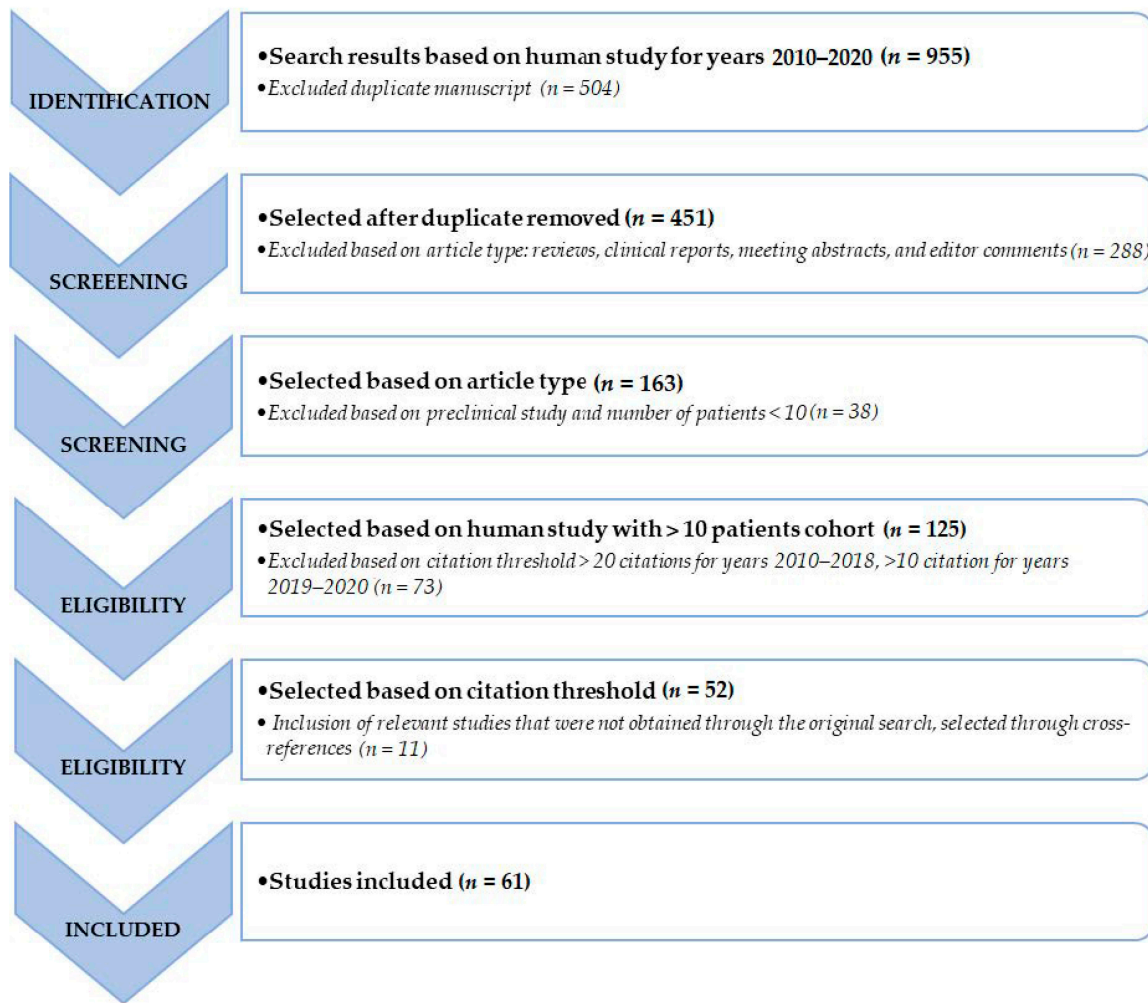
Figure 1. Schematic representation of the performed literature search and the review strategy.