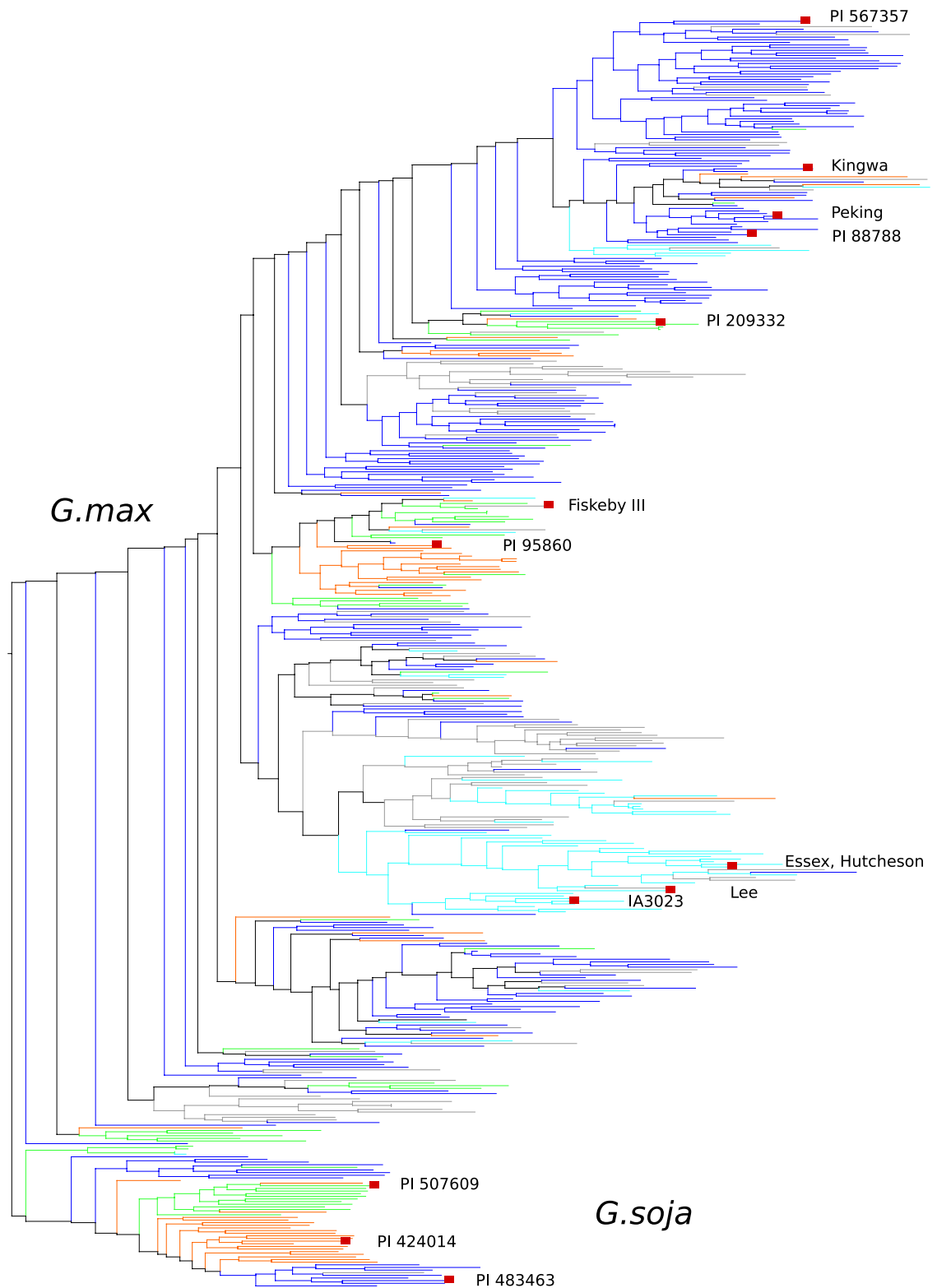
Fig. 1 Phylogenetic tree of the 481 re-sequenced accessions. The tree is rooted between G. max and G. soja accessions. Colors indicate countries of origin: blue, China; orange, Korea; green, Japan; cyan, United States; gray, all others (predominantly from Russia). Cultivars of interest are highlighted on the tree.

to LD, with greater density at chromosome ends and less density in the high-LD pericentromere, and avoiding closely-spaced SNPs. A tag was added to the genotype identifiers to indicate country of origin (Figshare file F2 11 ). A maximum likelihood phylogenetic tree was calculated using FastTree 31 , version 2.1.8, with default nucleotide parameters. Tree visualizations were generated using the Archaeopteryx tree viewer 32 .