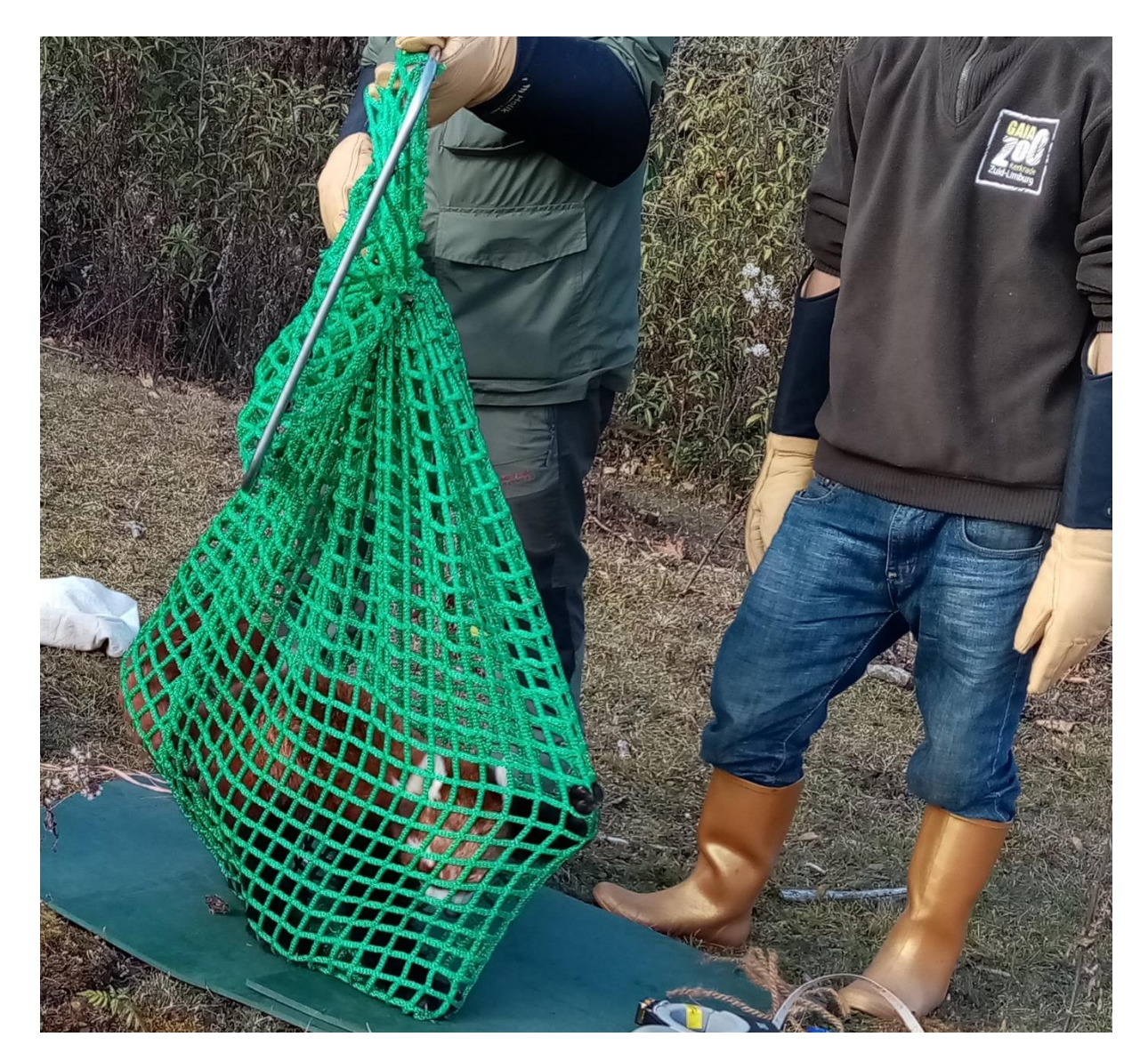
Figure 3. Net with a 1.5 m long handle was used to take the trapped animal out of the cage trap. The animal was taken out of this net after immobilization.

We covered the cage trap with hessian bags as soon as the panda was trapped to reduce their stress [2]. Three or four people went inside the fence and took the animal out from the trap with the help of a 1.5 m long net with a 50 \times 50 cm mouth (Figure 3). Handlers had to wear protective gloves and masks to prevent biting, scratching and possible transmission of zoonotic diseases. Then, we tied the mouth of the net and weighed the animal using a handheld digital scale. We transferred the trapped animal to a pre-identified flat site close by for immobilization, collaring, and to record morphometric measurements and undertake a health examination.