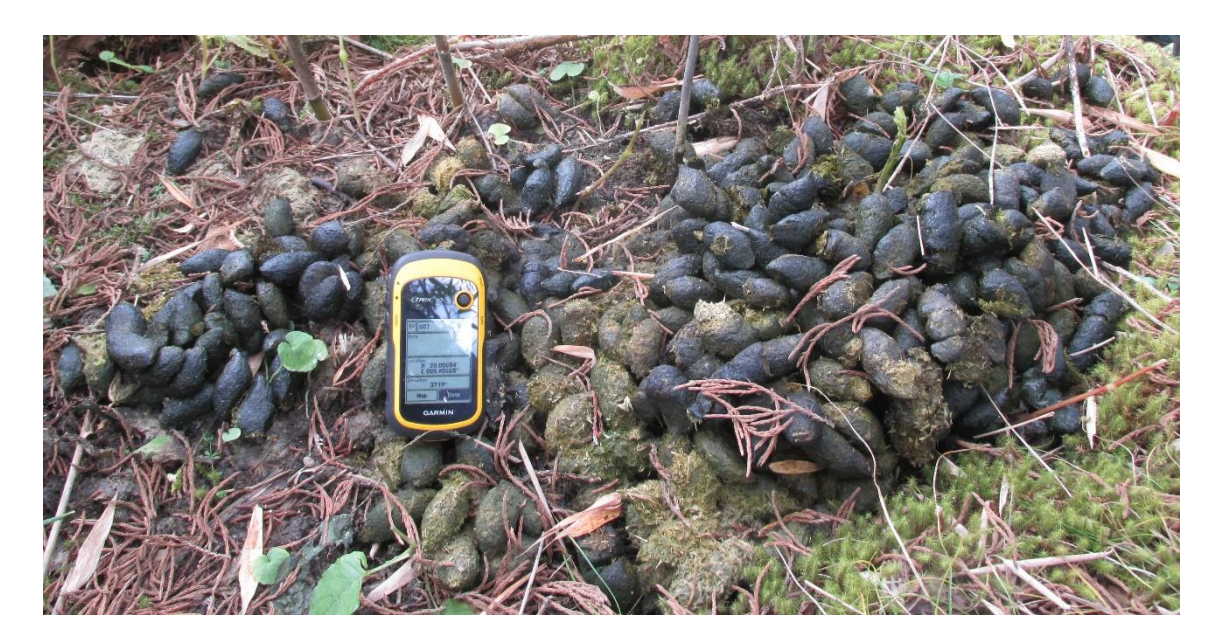
Figure 1. Red panda feces. Usually, fresh feces are greenish due to bamboo consumption in their diet. The color of the feces gradually fades with time. They use the same latrine sites for defecation where droppings of different ages can be easily seen (as in the figure). One animal can have many latrine sites within their home range. These latrine sites are believed to serve as territory markers..

Red panda feces (Figure 1) are the most reliable evidence to track their presence in the wild [30]. These droppings are spindle-shaped, soft, moist, and light green, but coloration also depends on their diet and age [13,30]. Usually, they defecate 1–15 pellets in a single defecation and frequently visit latrine sites where more than 100 pellets can be found on tree branches, fallen logs, and the ground [5,10,13]. Red panda feces contain partially digested bamboo leaves and shoots [13,25]. Himalayan black bears ( Ursus thibetanus ) and Assamese monkeys ( Macaca assamensis ) in this region eat and fully digest bamboo shoots, but their feces are located on different substrates and are of different size and shape.