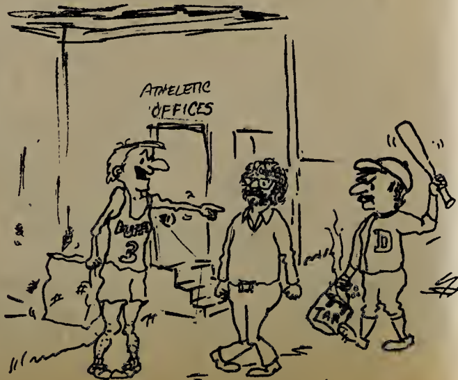
"YOU THE SPORTS EDITOR?!"

I feel I have now answered their complaints in a just and satisfactory way. I further invite any future complaints of a legitimate and mature nature.