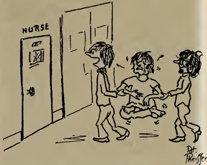
"HEY NURSE, WE GOTTA 'NOTHER EMERGENCY FROM THE YOGA CLASS!"