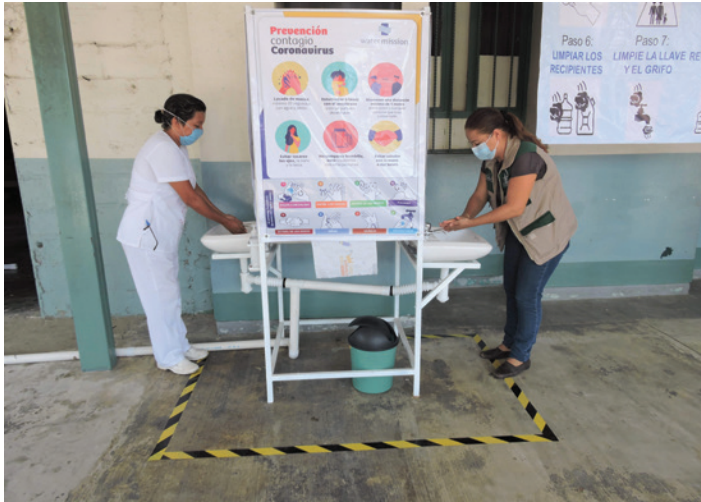
Two women use an emergency handwashing station installed at health-care facility in Mexico.

Recognizing the importance of hand hygiene as a method for infection and prevention control, Water Mission expanded its efforts in HCFs to include installations of emergency handwashing facilities in response to COVID-19. To date Water Mission has installed over 7,500 handwashing stations, of which 955 (12.6 percent) are installed in healthcare facilities. A critical component of the organization’s COVID-19 response includes partnering with local health actors to identify needs and mobilize resources quickly. A key example of this work can be found in Water Mission’s Mexico country program.