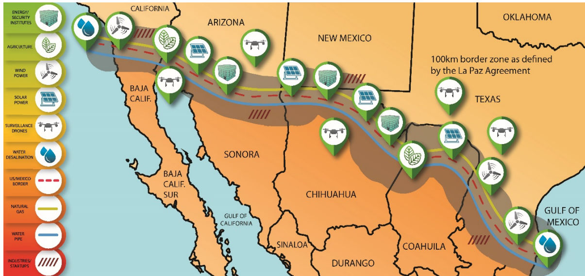
Figure 2. Conceptual Energy-Water corridor along the border.

provides an ideal opportunity for contracting individual sections separately and for private–public partnership opportunities for construction and operation. The expanded infrastructure necessary for power distribution (i.e., smart grids) is critically needed to handle existing and projected power requirements, particularly in California. The East-West solar corridor may also address power load shifting for the entire region; e.g., energy from the West can be used to alleviate load in the East during the early evening, while power from the East can provide pre-dawn generation to the West; thereby reducing the energy storage requirements and cost.