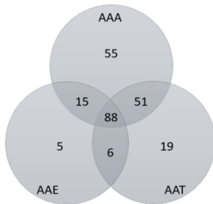
Figure 1. The distribution of self-reported AAI use among participants.

( N = 7 , 3%), including ball pythons, pot-bellied pigs, chickens, ducks, and goats.