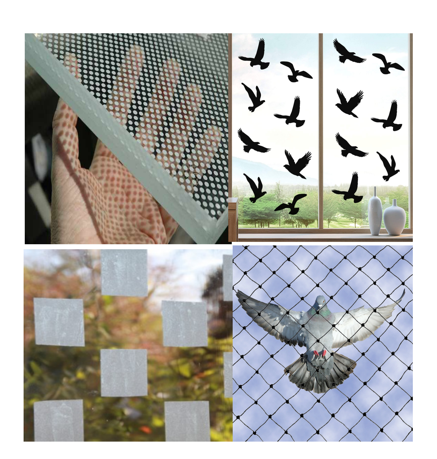
Clockwise from top-left: fritting, decals, netting, and ABC tape.

The mitigation techniques we have uncovered include: fritting, which is a pattern on the glass to deter birds, placing decals on the glass to alert birds that there is a solid surface, mosquito screens, netting, one-way transparent film, ABC bird tape and a motion activated sound system that will produce a noise to help prevent collisions.